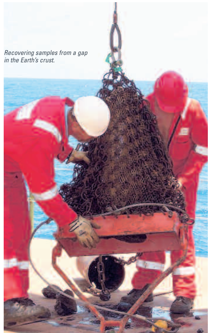
Recovering samples from a gap in the Earth's crust.