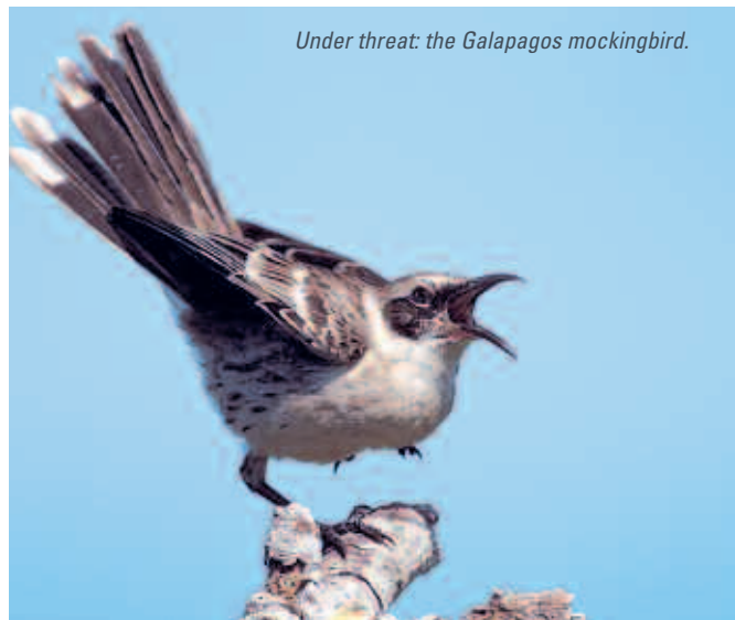
Under threat: the Galapagos mockingbird.

'I am convinced if we had not done the work on kestrel inbreeding we would not have credentials to do the Galapagos project.'