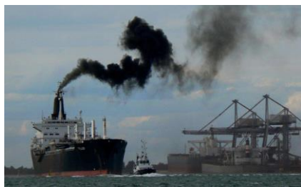
Figure 3. Air pollution by a cargo ship [13]

Impact of oil Transportation- Pipelines, tankers, railroads, cargo ships, and refineries may transport Petroleum Transportation Impact- oil. However, each of these routes has the risk that oil will leak and negatively influence the environment, such as by causing air pollution, as shown in Figure 3 [13]. Regardless of the mode of delivery, oil spills may significantly affect the economy, the environment, and human health.