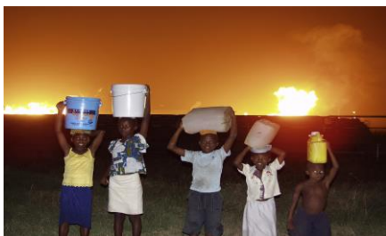
Figure 5. Gas Flaring into the Oil Producing Communities [14]