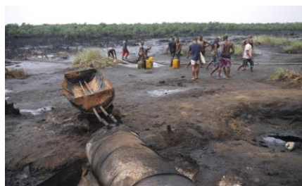
Figure 6. Vandalism of oil pipelines In Niger Delta Region [15]

Numerous small-scale oil spills added together can be just as hazardous to the area in question as a single large oil discharge. Without a question, the Niger Delta's oil spills and gas flare-ups have made it more challenging for endangered species to survive. This caused a dispute over environmental degradation between the host towns and oil and gas firms.