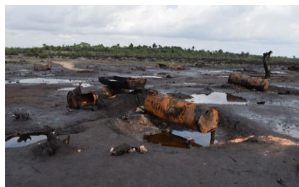
Figure 4. Corroded pipeline in the host communities [13]

As shown in Figure 4, a number of factors have led to environmental deterioration in the Niger Delta area, including equipment failure, inadvertent discharge, oil spills from storage tanks, spills brought on by ageing equipment, and operational difficulties because of oil and gas activities.