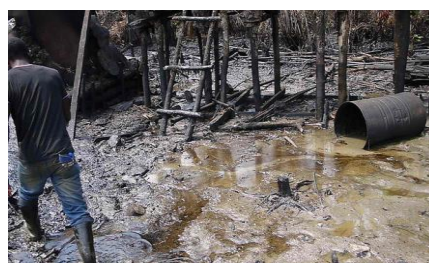
Figure 7. Illegal Oil Refinery and Affected Drinking Water by Oil [17]

Illegal oil bunkering: Figure 7 illustrates how oil bunkering, which is the theft of oil for personal benefit by unauthorised individuals, groups, or organisations, becomes a crime [17]. The primary motivation behind these militant groups is the aim to steal petroleum goods, with the ultimate goal of undermining both the security measures of the federal government as well as significant multinational oil and gas businesses.