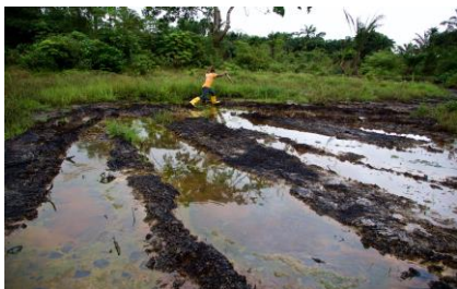
Figure 2. Accidental oil discharged [22]

These might be the consequence of unintentional discharges or even human mistake. Wastes generated during exploration and production also include air emissions, drill cuttings, drilling fluids, deck drainage, and well treatment fluids in addition to accidental oil spills as seen in Figure 2. Oil-related environmental problems are widespread in the Niger-Delta area and have a wide range of effects on people's economic and social well-being. These negative repercussions include a high unemployment rate that has sparked hostage taking, violence, and other problems. In the communities where some of these investments were made, these industrial operations—which had the potential to harm the environment and pollute it—were carried out in an uncontrolled manner, which led to the deterioration of health standards, contamination of water supplies, and destruction of traditional economic infrastructures.