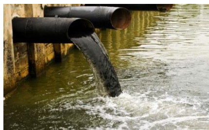
Figure 1. Produced water discharged to surface water [22]

Impact of Drilling Discharges- Since its discovery, oil has significantly harmed the environment due to outdated infrastructure and petroleum equipment. Figure 1 shows how oil may flood host communities during oil drilling operations and how hazardous drilling waste from hydrocarbons may flow into freshwater ecosystems [12]. They might be released into the environment, particularly in the Niger Delta, which would be extremely harmful to the ecosystem and people's health, possibly leading to an increase in cancer cases, respiratory infections, blood diseases, etc. As a result, the federal government is facing more complaints about oil and gas activities.