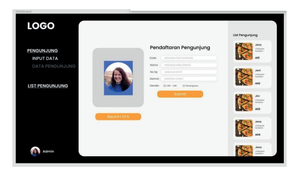
Figure 5: Dashboard Page Interface.