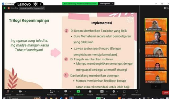
Figure 2: Online Socialization with CLC and External Parties