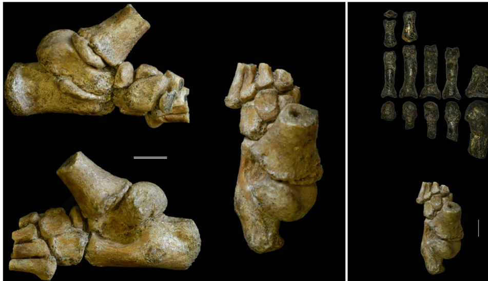
Fig. 1. A. afarensis juvenile foot DIK-1-1f. DIK-1-1f shown in (clockwise from top left) medial, dorsal, and lateral views. To right, dorsal view of DIK-1-1f and the adult A. afarensis foot A.L. 333-115. Scale bars, 1 cm.

with age (9). In contrast, apes maintain a convex surface and exhibit only moderate flattening of the ossified part of the joint surface as they grow. An adult A. afarensis medial cuneiform (A.L. 333-28) has a hallux facet that is flatter than in an ape of similar size but more convex than that found in modern humans (Fig. 3) (8, 9). Since A.L. 333-28 and DIK-1-1f are representatives of adult and juvenile A. afarensis , the change in facet curvature during growth in A. afarensis was probably similar to the pattern in apes and distinct from that found in humans (fig. S5). These data suggest that multidirectional loading of the hallux tarsometatarsal joint in juveniles may have maintained the curved facet in A. afarensis throughout ontogeny.