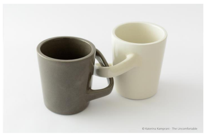
Figure 2 Engagement Mugs by Kamprani available at https://www.theuncomfortable.com/portfolio/engagement-mugs-2/#open

the work of Katerina Kamprani in her 2017 project 'The Uncomfortable,' which involves reimagining everyday objects to render them functionally absurd, exemplified by the 'engagement mug'.