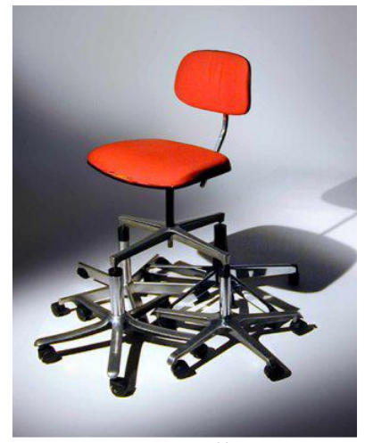
Figure 4 Ball and Naylor Archaeology of the Invisible

In the digital domain, Soren Iverson's work involves replicating features from popular apps to offer commentary on our interactions with technology. This includes instances like encountering ChatGPT within Apple iMessages, witnessing an Instagram feature that permits users to pay a fee to retract 'deep likes', or experiencing a Tinder review system reminiscent of Lyft-style ratings.