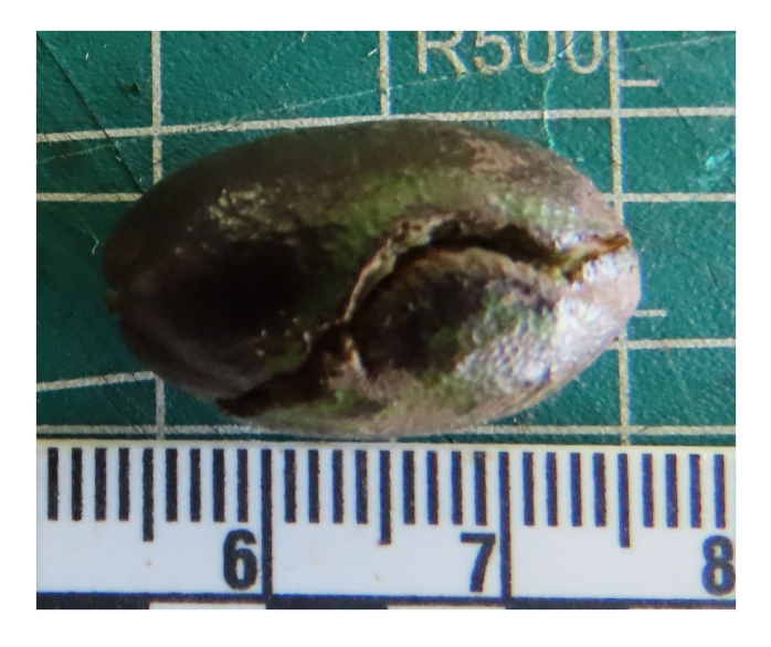
FIGURE 2 A Sapotaceae fruit eaten by Chiropotes , showing the curved insertion point of the dental arc of the procumbent incisors, and the lateral rips subsequently made by the robust, splayed, and canines. Photo Credit: Justin A. Ledogar of fruit bitten by Chiropotes sagulatus in Suriname.

To provide comparability, and to ensure selection estimates were conservative, we used the same categories as Barnett, Ronchi-Teles, et al. (2017); Barnett, Silla, et al. (2017); values \pm 0.33 to either side of zero (neutral) indicated no selection had occurred; values < -0.33 indicated negative selection (active avoidance), and values >+0.33 indicated active selection.