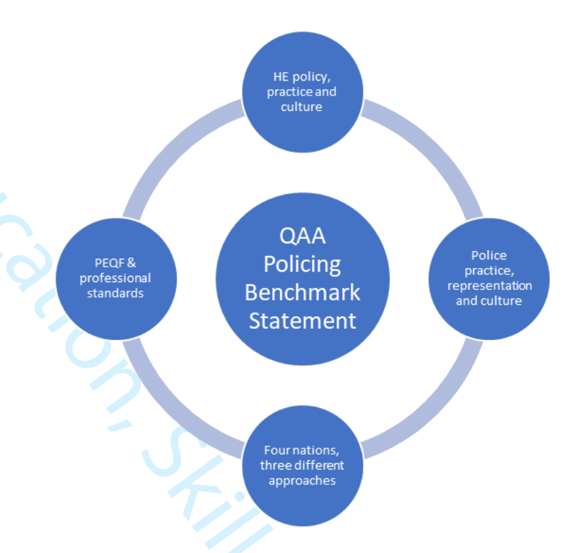
3enchmark \( \) Figure 1: Stakeholder Context for the QAA Benchmark Statement in Policing (figure by authors, 2023)