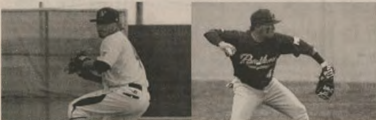
As a Panther Sanchez is 2-1 with 25 strikeouts and eight walks in 27.2 innings..