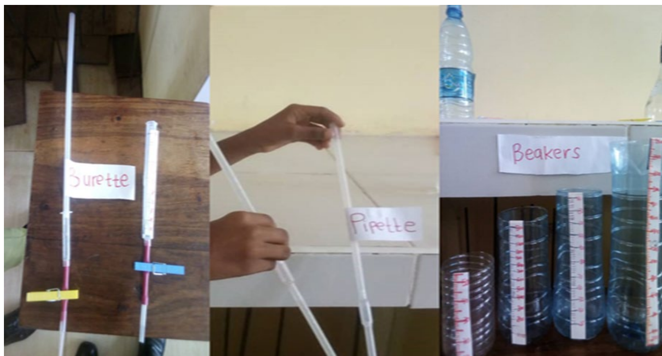
Figure 1. Samples of Burette, Pipette, and Beakers locally made by students

Researcher: Can you tell me more about how you find yourself different from others