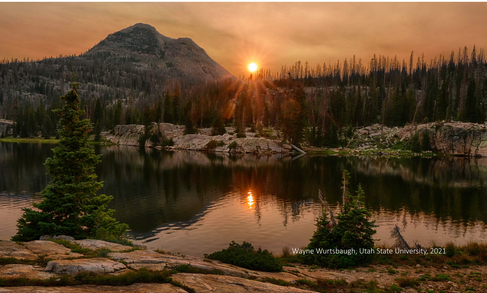
Wayne Wurtsbaugh, Utah State University, 2021

Measuring and tracking the results of water and land use integration is vital to determining whether your community’s plans and goals are being met. Growing Water Smart Metrics: Tracking the Integration of Water and Land Use Planning offers a set of indicators that can be assessed for year-over-year trends to demonstrate achievement of water savings through land use planning. Ten progress metrics track whether: the community’s land use plan integrates water efficiency and its water plan integrates land use strategies; conservation-oriented system development charges and pricing structures are being used; indoor and outdoor water efficiency measures are being utilized; and collaboration around development proposals is occurring. Fourteen impact metrics measure increasing or decreasing trends in water demand and use and trends in development patterns and land use.