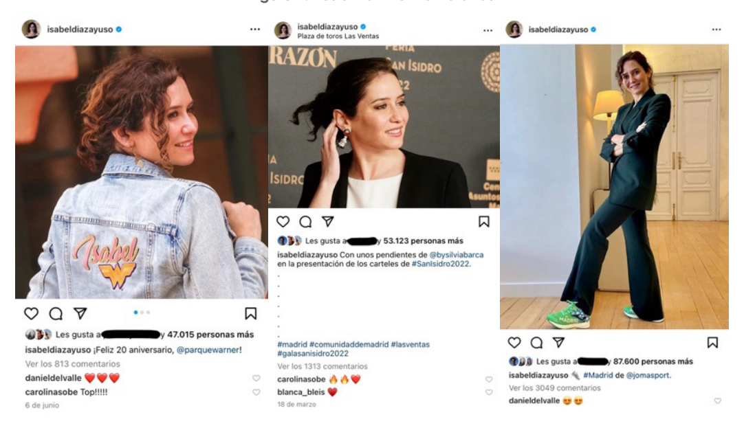
Figure 2: Posts that mention brands

Source: https://www.instagram.com/p/CedxifYN7Oc/?hl=es; https://www.instagram.com/p/CbQJWTiNmPv/?hl=es; https://www.instagram.com/p/CY6ZWNYNTCh/?hl=es