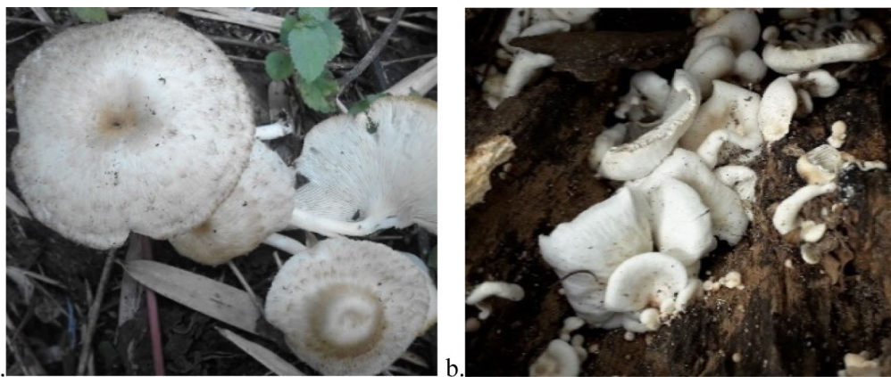
Fig. 2 The studied mushroom species in their natural habitat: (a) Lentinus squarrosulus (b) Neonothopanus hygrophanus