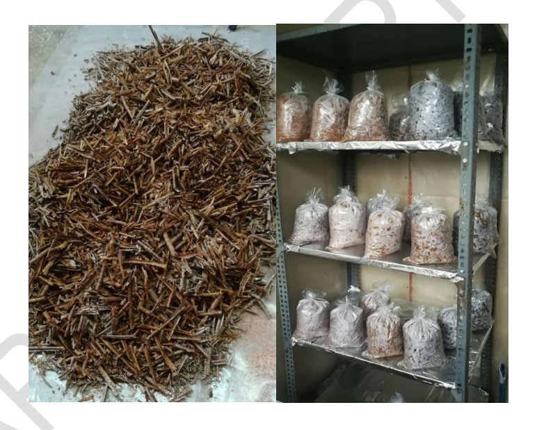
Figure 1: Compost materials and bags.

Wood sawdust was sterilized in an autoclave at 121 °C for 30 minutes to inactive detrimental organisms. After the cooling period (25 °C), the composts were prepared with 96 % wood sawdust, 3 % mycelium, and 1 % calcitic lime for pH balance in 29 cm x 45 cm bags - 4 as 1 kg for each variation as seen Figure 1 (Estrada et al. 2009, Yılmaz et al. 2017b).