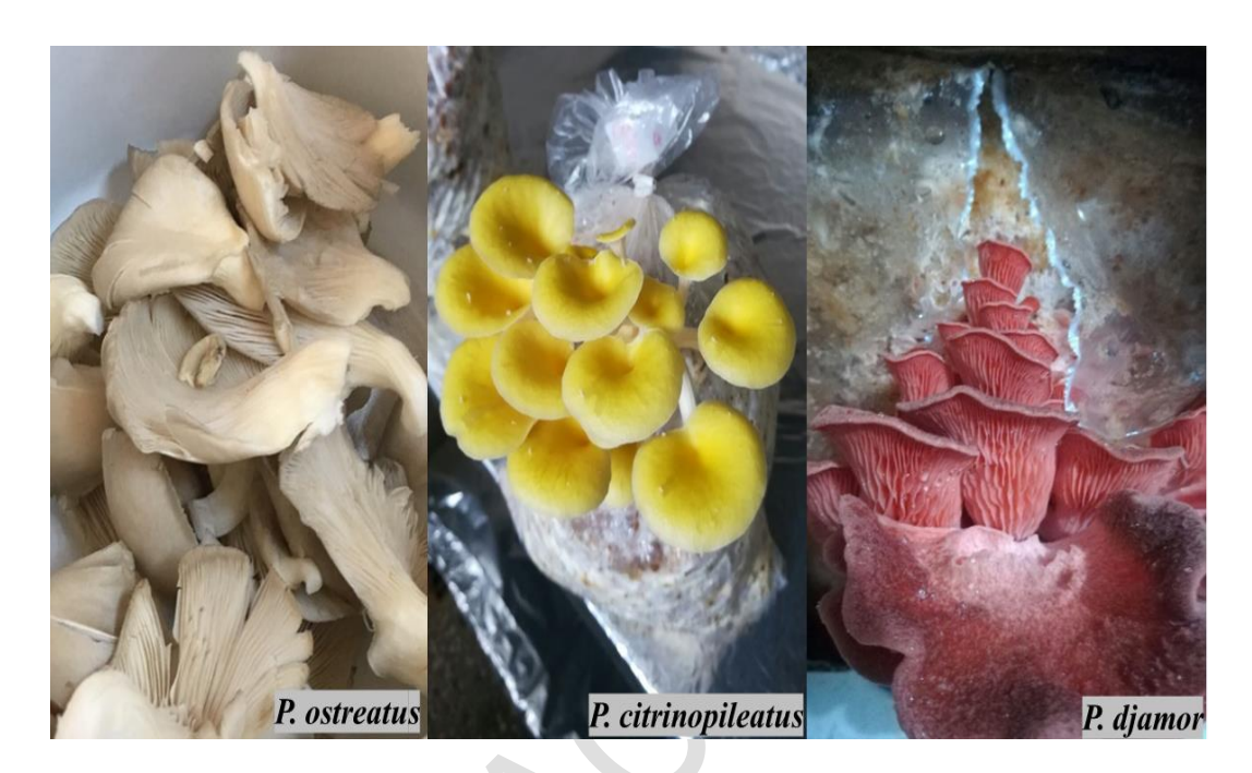
Figure 2: Cultivated mushrooms.

pouches were perforated to encourage mushroom development. The oyster mushrooms were harvested with a knife when they reached the same size (Figure 2).