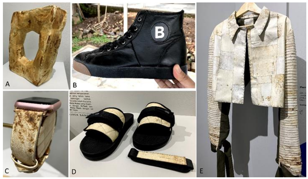
Figure 2 . Mycelium-based interior design (A) and fashion (B - E) products (presented in men.ja.mur exhibition July 7<sup>th</sup> – August 3<sup>rd</sup> 2022, Bandung, West Java)

created biomaterials for architecture, interior design, and fashion (Figure 2). Fashion items from MYCL have been displayed at renowned worldwide fashion events (Heisel et al., 2017).