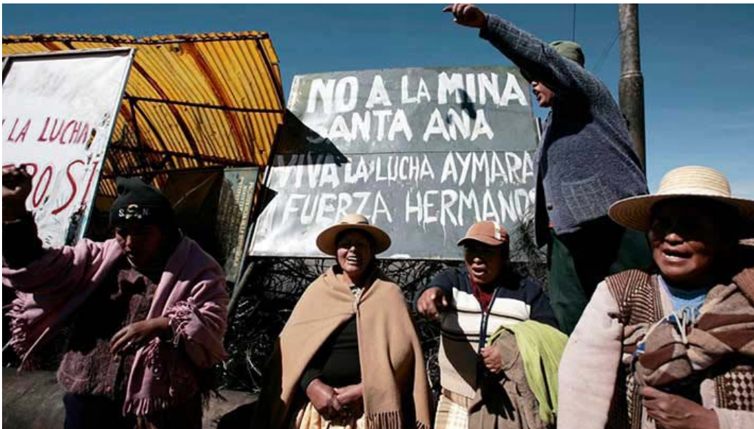
Posted June 9, 2022 In Mining

The case of Bear Creek v. Perú is one such example. In this dispute, Bear Creek, a Canadian mining company, engaged in exploratory work in the Santa Ana mine site in Perú (a rural area bordering Bolivia) that it eventually sought to bring to production. 42 Peruvian law, however, incorporates several legal requirements that a company must undertake prior to exploitation of a mine. For instance, Bear Creek had to reach agreements with all landowners on the mine site to ensure permission for surface land use, 43 and would need several governmental authorizations to develop the mine. 44 Before the company could secure these government authorizations, the law required a complete ESIA for the production or exploitation stage. Only with the approval of an ESIA could the company seek other authorizations required to begin mining operations (e.g., authorizations for water use, transportation, power supply, etc.). 45 Although Bear Creek submitted an ESIA for the project, the government identified several deficiencies preventing its formal approval. 46 In addition, an important element of the ESIA at the time was the requirement of mining developers and government officials to engage in consultations with all affected communities via a “Citizen Participation Plan,” 47 which is a necessary step toward securing community approval to operate. 48