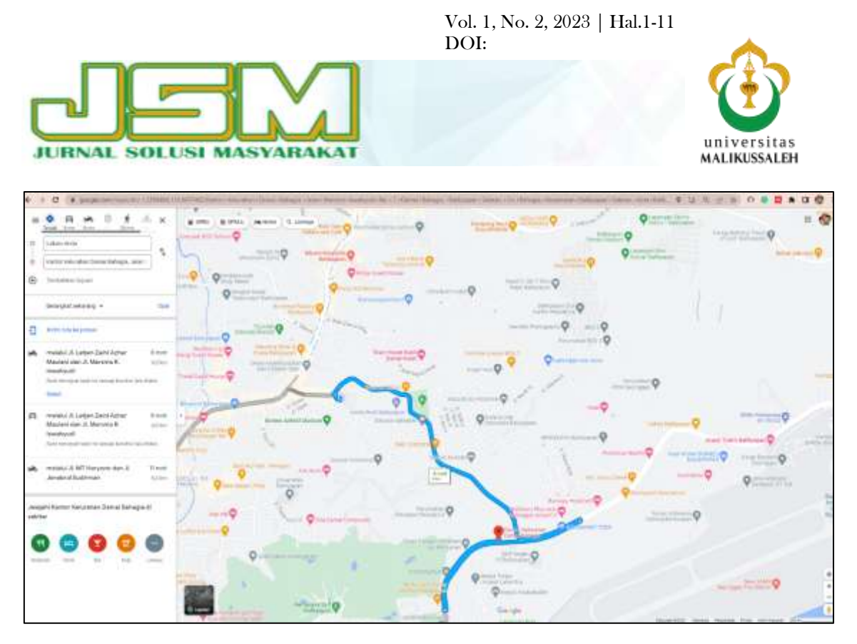
Figure 4. Location of community service at university in balikpapan city point