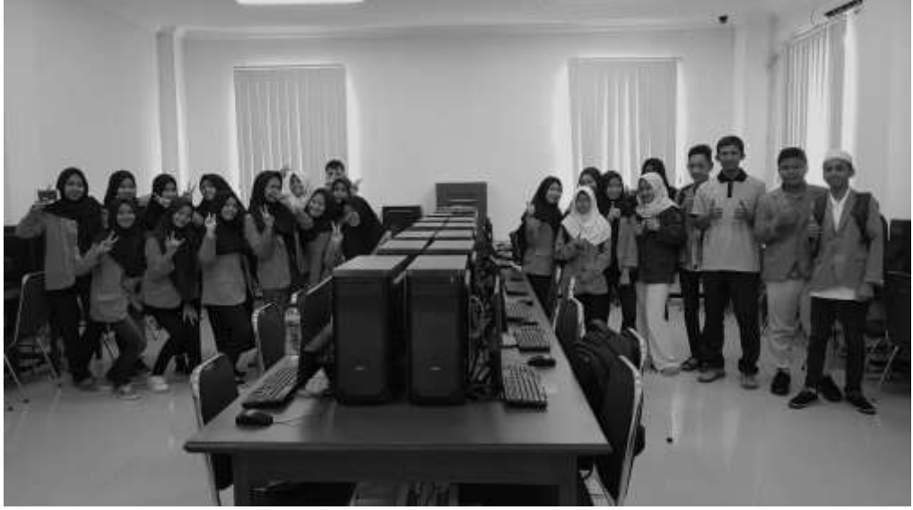
Figure 2. The testing was carried out by students