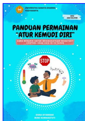
Picture 3. Book cover

Third, researchers develop products. The product creation stage consists of three parts, namely the beginning, content, and end. The first part of the book consists of a cover, preface, and table of contents. The following is the cover image of the game manual.