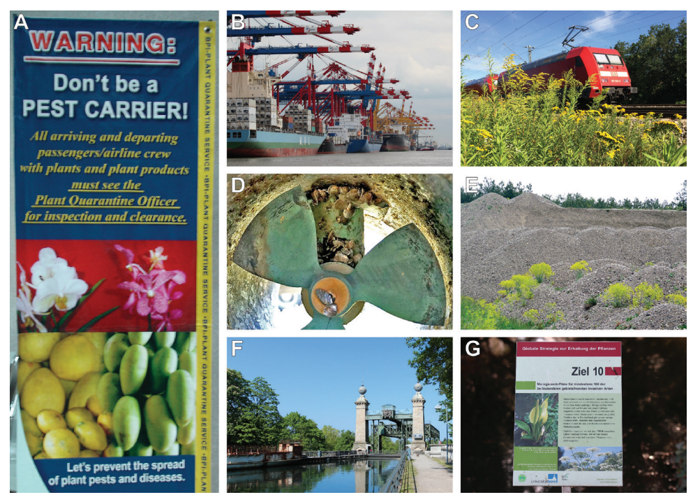
Figure 2. Examples of issues addressed in the first German action plan on the pathways of invasive alien species A in or on humans or in their luggage (M20) B in ballast water of seagoing and inland ships (M13, M14) C in or on trains (along railway lines) (M21) D growth/accumulation on the hull of ships (M15, M16) E contamination of gravel (M10, M11) F unassisted dispersal along canals or waterways between river basins, lakes and seas (M22, M23, M24) G botanical gardens (M1, M2). M# means Measure number in Table 2.

holders in only one sector. Four measures were laid out across different pathways. 50% of the measures have the aim to raise awareness, which is achieved by (a) public relation activities and by (b) educating and training relevant stakeholders on how species are spread along the prioritised pathways and possible consequences. The other 50% of the measures intend to minimise contamination of goods, commodities, vehicles and equipment by specimens of invasive alien species, including measures to tackle transportation of invasive alien species from third countries, which is done by (c) developing and publishing technical documents or by (d) addressing the need of targeted research projects. Examples of issues addressed in the action plan are illustrated in Fig. 2.