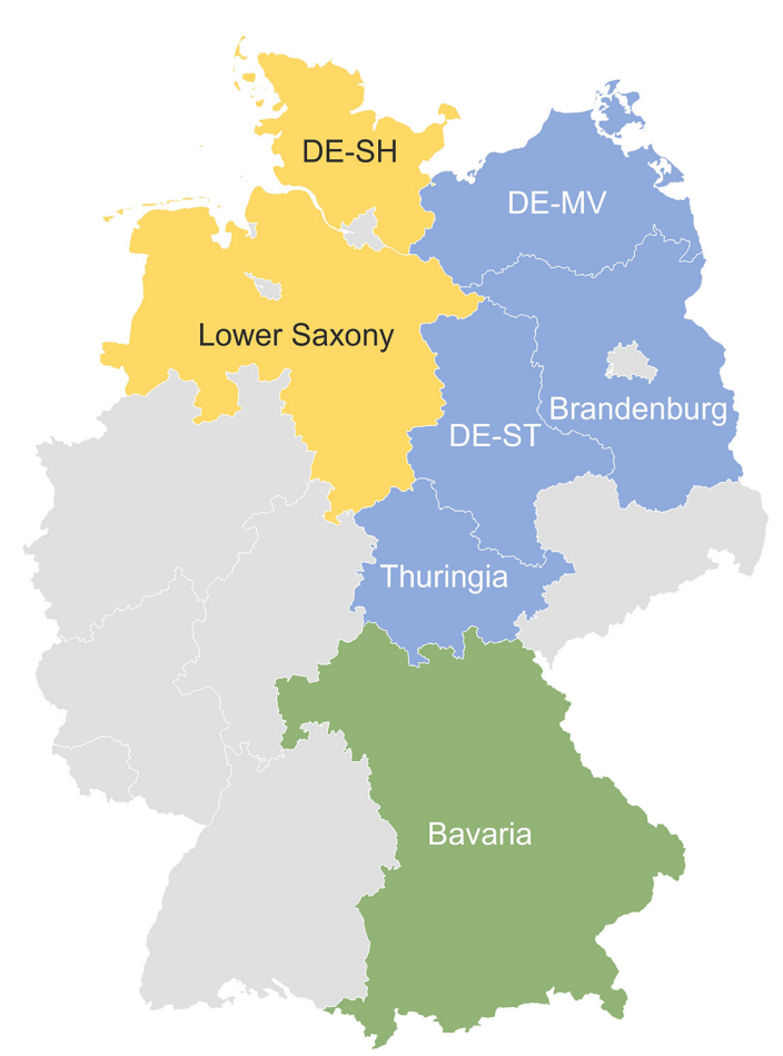
Figure 1. Study regions included North (Schleswig-Holstein [DE-SH] and Lower Saxony in yellow), East (Mecklenburg Western-Pomerania [DE-MV], Brandenburg, Thuringia, and Saxony-Anhalt [DE-ST] in blue) and South (Bavaria in green) as defined by PraeRi (2020).

prevalence of 30%), hence a standard deviation of 7 and a precision of 1, 2, 3, and 4 was assumed (Glaser and Kreienbrock, 2011). Based on these scenarios and taking into consideration feasibility (e.g., how many cows can be scored per day, how many farms can be visited during the 3-yr period of the study given a single 1-d visit), the sample size for each study region was determined to be 250 farms. Selection of farms based on administrative district and on herd size (number of cows) within the respective federal state and study region. Using an automated randomization algorithm, farms were randomly sampled based on the national animal information database (Herkunftssicherungs- und Informationssysem für Tiere, HIT; https://www.hi-tier.de/ ) and on the farm data from the Milchpruefring Bayern e.V. in South, as well as from the state control associations (Landeskuratorium der Erzeugerringe für tierische Veredelung) in North and East. A list of farms within the target population was available and an automated