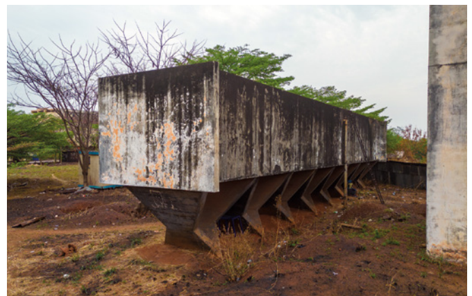
02 The water tower and tank, University of Nigeria Nsukka (Enugu Campus), Enugu, Nigeria.