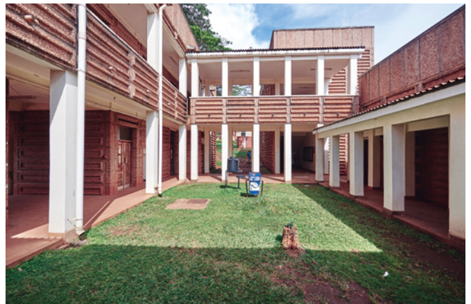
27 Courtyard of the Faculty of Education, Kyambogo University, Kampala, Uganda.