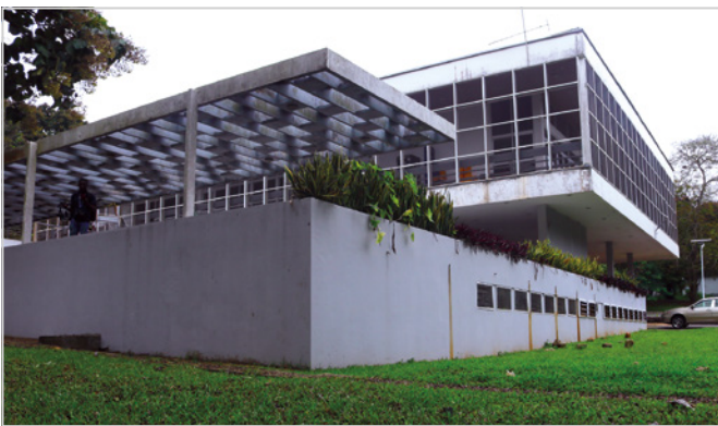
13 Senior Staff Clubhouse, Kwame Nkrumah University of Science and Technology (KNUST), Kumasi, Ghana. © Jonathan Kplorla Agbeh, 2022.

The three buildings, all predominantly cubical/cuboidal in forms, are extensively shielded by sunscreens and are seamlessly integrated with nature. This broader perspective underlines the shared architectural heritage of the three different cities of Kumasi, Accra, and Ilé-Ife. It emphasizes that architecture communicates more than mere brick and mortar; it characterizes and captures the way of life of a people while accommodating their climatic conditions [FIGURE 15].