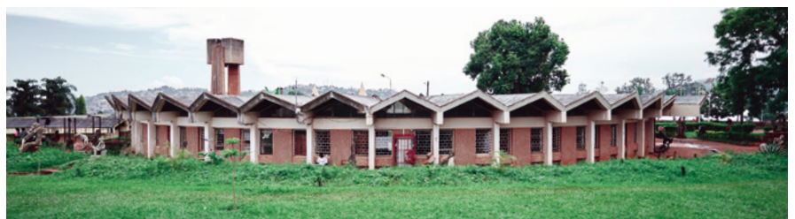
22 Total view of the School of Fine Art and Industrial Design, Kyambogo University, Kampala, Uganda.

The School of Industrial Fine Art is located on the west side of the university. It consists of two semi-circular buildings designed concentrically. It features a circular courtyard actively used by students [FIGURE 22 - FIGURE 24].