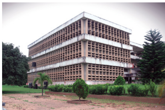
15 Faculty of Agriculture, Obafemi Awolowo University (OAU), Ife, Nigeria.