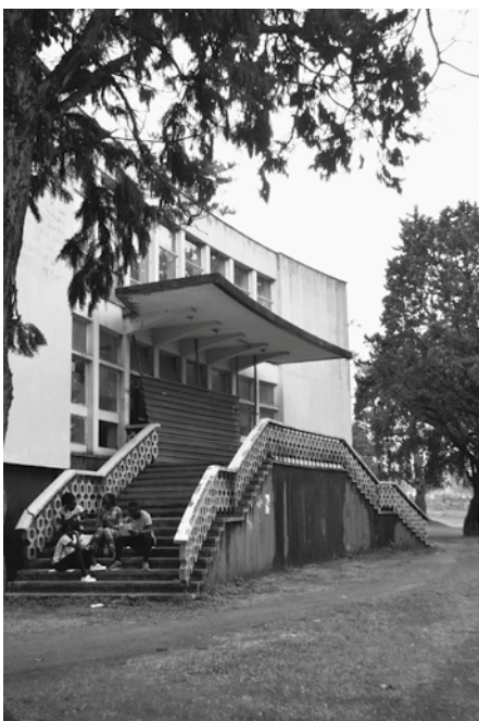
16 Entrance at Main Hall West End Kyambogo University, Kampala, Uganda.

The student housing complex was constructed in 1956 [FIGURE 18]. Its design is identical to around six other housing complexes nearby at the University of Ghana's Legon campus, reflecting a common theme prevalent in modern campus buildings.