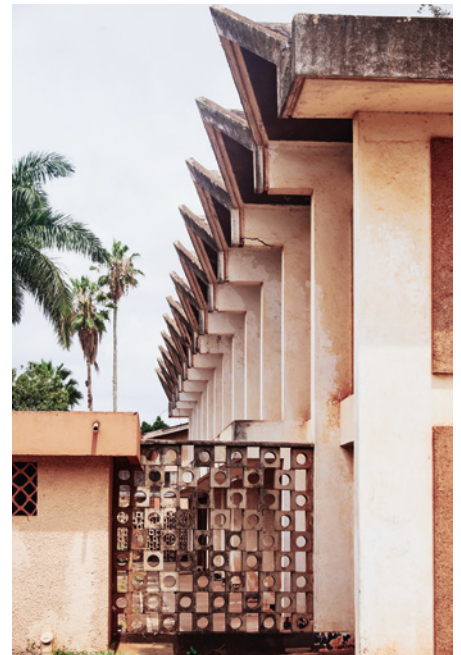
19 Courtyard view of the Barclays Library, Kyambogo University, Kampala, Uganda.

The Barclays Library is located on the western side of Kyambogo University. The buildings were completed in 1965. The complex comprises two buildings parallel to each other and an ablution building on the eastern edge. The courtyard is formed by all three buildings and a hollow block wall on the western edge [FIGURE 19 - FIGURE 21].