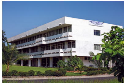
04 School of Nursing and Midwifery, University of Ghana, Legon, Ghana.

This building has the style of American late modern buildings, though we were not able to ascertain when exactly it was built. The tropical modern emphasis on natural ventilation is evident in its design, with bands of balconies on either side of the building [FIGURE 04]. It is still in use as it was designed for.