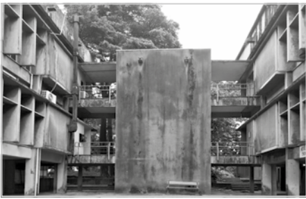
07 Faculty of Engineering complex showing a semi-subterranean promenade connecting a cluster of buildings in the faculty.

that provides protected access to other buildings in the Main Concourse. The Faculty of Engineering and the Faculty of Sciences complex [FIGURE 07] offer recessed accommodation on the ground floors to accommodate a continuous link of pedestrian circulation that connects different functions of the faculty without exposure to the outdoor elements. This solution enables the normal function of the facilities even in the most inclement weather situation.