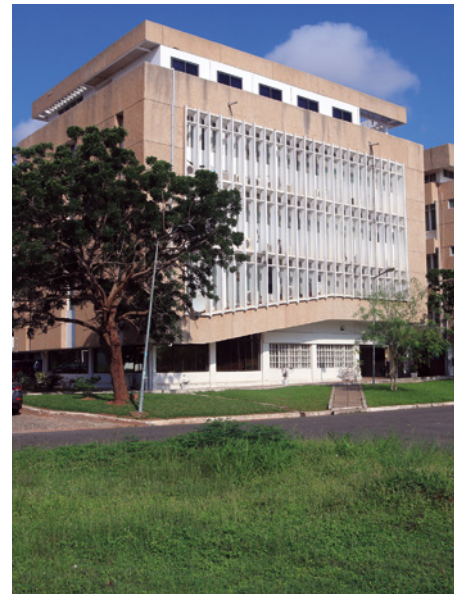
36 Human Resource Directorate, University of Ghana, Legon, Ghana.

Unlike the above-mentioned buildings which have brise-soleils or sun-breakers attached to their facades, this building has generous roof overhangs which provide adequate shading and prevent internal heat gain from direct solar radiation. It has a circular shape with a width-to-length ratio of 1:1 approximately; this is considered the optimum shape and ratio for minimizing the total solar insolation [FIGURE 38].