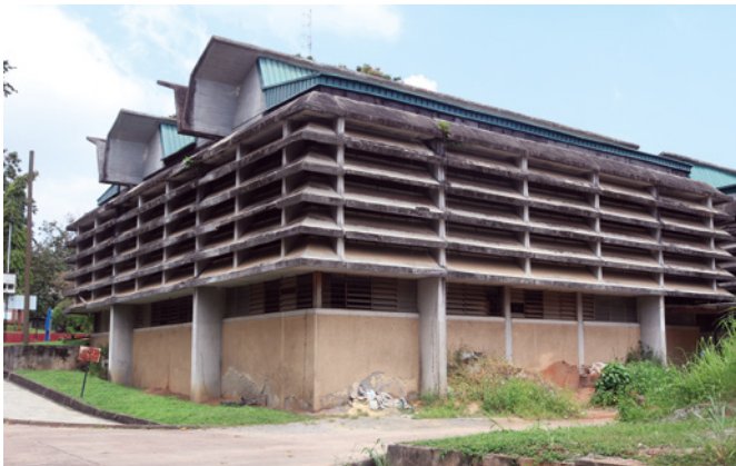
37 Faculty of Engineering, University of Lagos, Nigeria.