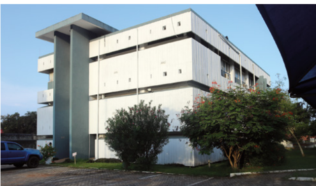
14 Department of Nutrition and Food Science, University of Ghana, Legon, Ghana