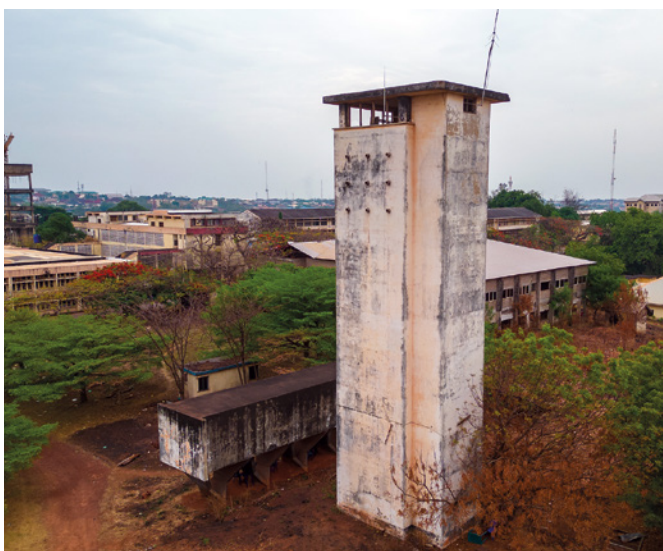
01 The water tower and tank, University of Nigeria Nsukka (Enugu Campus), Enugu, Nigeria.

Built in the 1950s as one of the first constructions on campus, these twin structures survived the Nigerian Civil War (1967-1970). With unpolished and angular features, their style can be classified as a brutalist variant of Modernism. The water tower [FIGURE 01] is the higher building, while the water tank [FIGURE 01] is the longer building. Today, the twin structures [FIGURE 01] no longer serve their intended function (supplying water) due to lack of maintenance but have instead turned into an informal reading hub for students (Nnaemeka-Okeke et al., 2021).