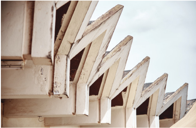
24 Roof details of the School of Fine Art and Industrial Design, Kyambogo University, Kampala, Uganda.