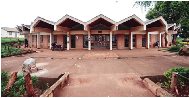
23 Main entrance of the School of Fine Art and Industrial Design, Kyambogo University, Kampala, Uganda.