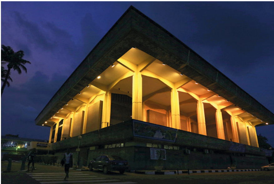
35 The main auditorium, University of Lagos, at night © Bola Oguntade, 2018.