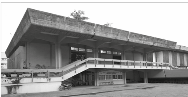
06 Bursary building showing a covered walkway, part of the connected main concourse covered walkways.

seasons", which was inspired by the work of "several architects who had experimented with alternatives or additions to the sheer and well-glazed facades of modernism that although useful in the winter of western Europe, performed as a greenhouse in warmer conditions" (Le Roux, 2003). The architecture of the University of Lagos (UNILAG) campus provides many examples of implementing and facilitating pedestrian circulation, natural ventilation, as well as natural lighting and shading.