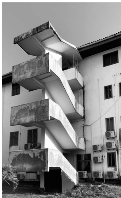
17 Staircase at the Computing Systems Building, University of Ghana, Legon, Ghana.