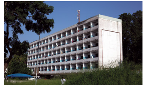
05 Legon Hall Annex 'A', University of Ghana, Legon, Ghana.

Legon Hall was built in 1952 as the first student accommodation built on the University of Ghana campus. This hostel was built in the classic British post-WWII modern style of social housing blocks that prioritised efficiency over customisation. Typical of this style, its ground level was originally dedicated to storage space, also making space for a pedestrian bypass. Like the School of Nursing and Midwifery building, this hostel building is also being used as it was intended to be used [FIGURE 05].