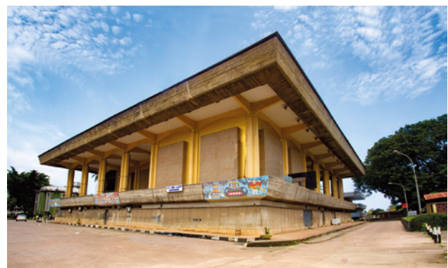
33 Left: The University of Lagos Main Library. Right: The Main Auditorium (J.F. Ade Ajayi Auditorium).