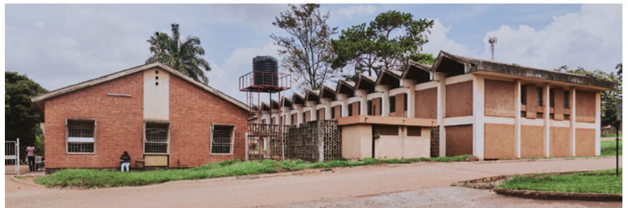
20 The Barclays Library, Kyambogo University, Kampala, Uganda.