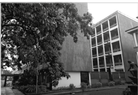
10 Faculty of Arts building, showing east-facing façade.

The two predominant air masses that impact the climate of Lagos are the trade winds: the North East Trade (between the end of November to mid-March), which heralds the Harmattan season, and the South West Trade wind (April to October), which brings the rainfall. The South-West Trade wind is dominant due to the tropical maritime air mass from the South Atlantic (Uchekukwu et al., 2018). This information is critical because the wind direction is a major factor in maximizing the passive ventilation capacity of the campus buildings. The Faculty of Arts building is an example of this orientation. It consists of two rectilinear buildings joined by connected vertical circulation and corridors with their shorter sides skewed slightly off west/east axis, exposing the longer sides to southwest and northeast