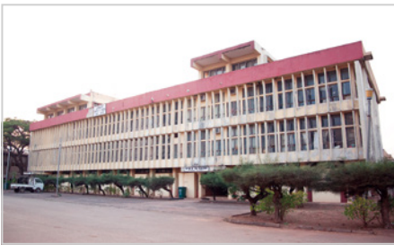
03 The University Library and Registrar's Office, University of Nigeria Nsukka (Enugu Campus), Enugu, Nigeria. © Immaculata Abba, 2022.

As one of the first buildings constructed on campus, also in the 1950s, this building features the typical vertical and horizontal concrete screens used to protect the building and its users from the harsh weather [FIGURE 03]. It is still being used as intended but the faded paint, damp walls and missing letters on the 'Office of Registrar' plaque point to a lack of building maintenance.