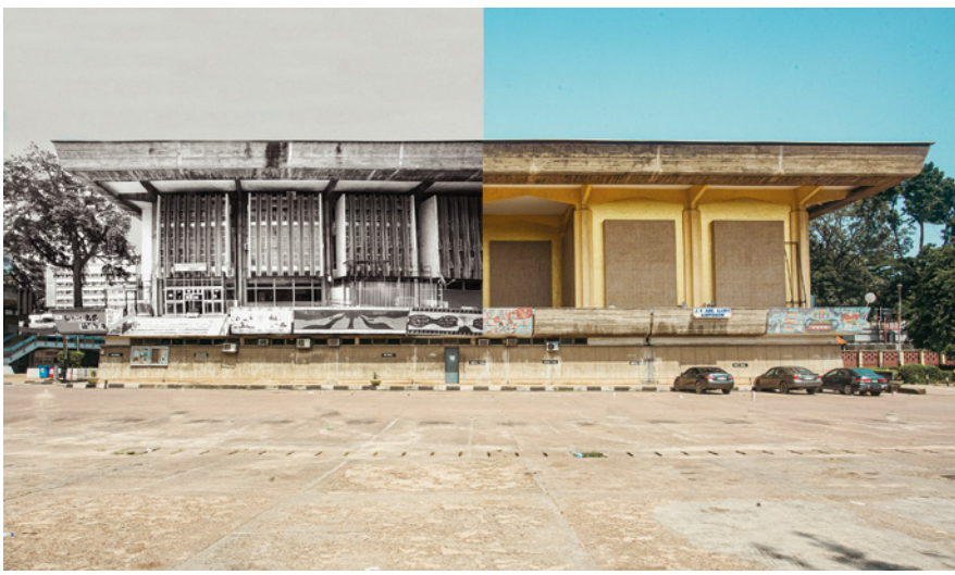
34 Synthesized picture of the main library and main auditorium, showing the similarities in structure and external finishes of both buildings. © Bola Oguntade, 2022.