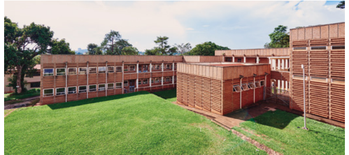
26 Aerial view of the Faculty of Education, Kyambogo University, Kampala, Uganda.