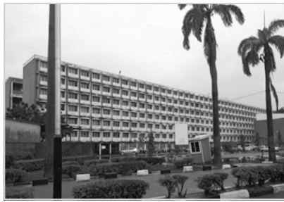
08 Figure 03: Faculty of Arts building showing south-facing façade.

winds [FIGURE 08]. The large fenestrations on the façades and open ground floors allow a constant airflow through the buildings. The open ground level plays a crucial role here as a central courtyard, framed by the connection between these two buildings. The Pilotis base architecture ensures a continuous flow of air by channeling it through the courtyard from the southwest during the wet seasons and from the northeast in dry seasons. The air is constantly replaced by fresh air, thereby keeping the internal temperature regulated [FIGURE 09]. The southern block (Block A) consists of faculty and administrative offices, while the northward block (Block B) has classrooms on each floor. The external façade of both blocks is finished with precast concrete overhang cells spanning from floor to floor in a 2.7 x 2.7m grid, providing shading for the internal spaces from incident sun. On the courtyard side of the office block, only clearstory windows have been provided as they are adequate for ventilation and satisfy the need for privacy [FIGURE 09]. At the classroom block, openings on the courtyard walls extend along the