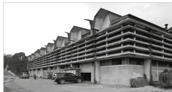
12 Faculty of Engineering Lab Building showing concrete louvered wall fenestration and north light roof.

The design of the Faculty of Engineering Lab building ensures multiple points of entry for both natural and ambient light, with deep overhangs keeping internal spaces dry during the heavy rain months. These labs serve a variety of purposes, including metalwork, concrete testing, and fabrication, among others. To achieve optimal lighting conditions for diverse activities, levels ranging from 100-250 Lux are maintained, depending on the specific task being done. The façade reveals an array of precast louvered concrete fenestrations that allows indirect lighting along the laboratory walls and a series of north-facing skylights on the roof of the lab building to filter in the natural light [FIGURE 12]. Unfortunately, both the north-facing skylights and the concrete roof have been covered with corrugated aluminum roofing sheets. This modification was necessary due to the concrete's inability to maintain a watertight seal.