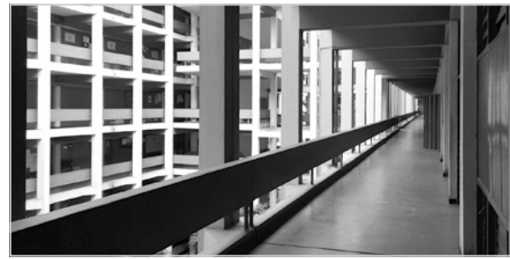
09 Faculty of Arts building from the courtyard, showing the shaded balcony and corridor of the administration with the faculty offices in the distance.

entire length, except at the levels where students are seated in the classroom. This design fulfills the requirement for substantial air exchange in areas with high occupancy, while also minimizing distractions to classroom activities. Classrooms feature louvered openings with focus panels [FIGURE 10, FIGURE 11].