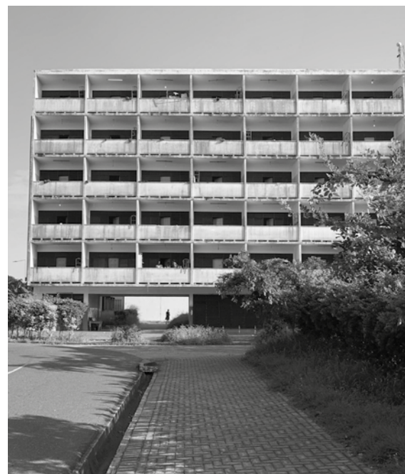
18 Accommodation block, University of Ghana, Legon, Ghana.