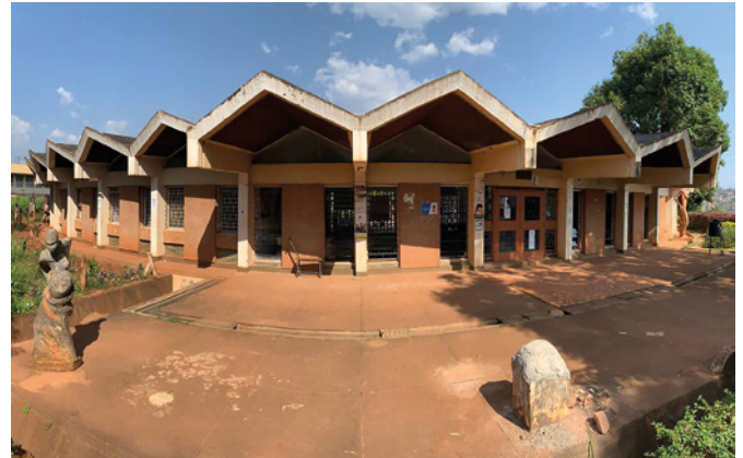
38 School of Industrial Arts and Design, Kyambogo University, Kampala, Uganda.