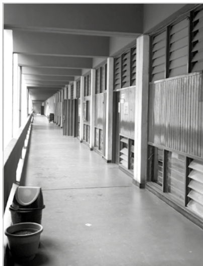
11 Faculty of Arts building from the courtyard, showing louvered classroom opening with focus panels.

winds [FIGURE 08]. The large fenestrations on the façades and open ground floors allow a constant airflow through the buildings. The open ground level plays a crucial role here as a central courtyard, framed by the connection between these two buildings. The Pilotis base architecture ensures a continuous flow of air by channeling it through the courtyard from the southwest during the wet seasons and from the northeast in dry seasons. The air is constantly replaced by fresh air, thereby keeping the internal temperature regulated [FIGURE 09]. The southern block (Block A) consists of faculty and administrative offices, while the northward block (Block B) has classrooms on each floor. The external façade of both blocks is finished with precast concrete overhang cells spanning from floor to floor in a 2.7 x 2.7m grid, providing shading for the internal spaces from incident sun. On the courtyard side of the office block, only clearstory windows have been provided as they are adequate for ventilation and satisfy the need for privacy [FIGURE 09]. At the classroom block, openings on the courtyard walls extend along the