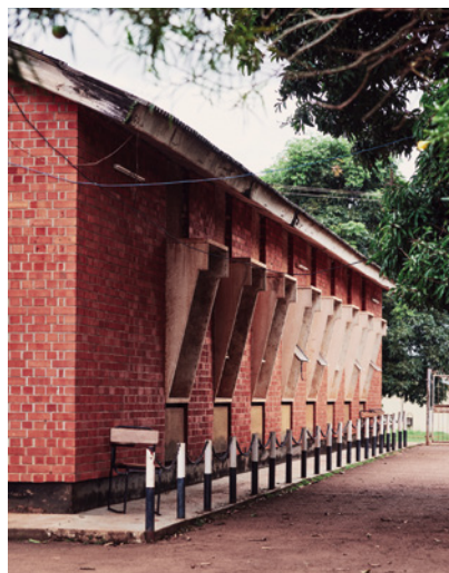
21 Façade detail of the Barclays Library, Kyambogo University, Kampala, Uganda.