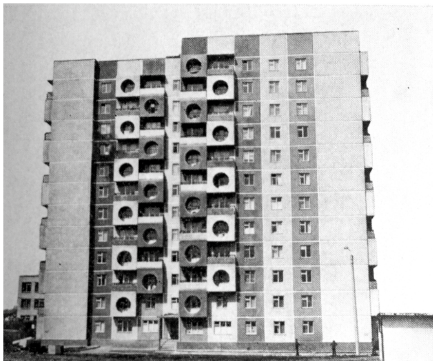
03 Towers with giant oculi panels in Mykolaiv by Piotr Bronnikov, 1970s. © Private collection.

and assimilation of innovative foreign constructions. This diversity of solutions tends to contradict the prejudice of a Brezhnev architecture in stagnation: on the contrary, then the builders sometimes tried successfully to play with the constraints of the Soviet system 23 . Some of the best apartment buildings of this period should be considered valuable achievements and should be given heritage protection if possible.