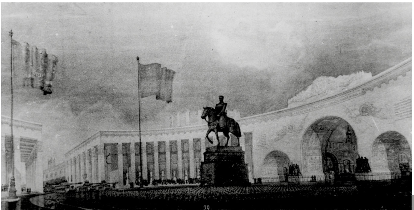
01 Project for the reconstruction of Kyiv by Aleksandr Vlassov (dir.), 1944 © Private collection.