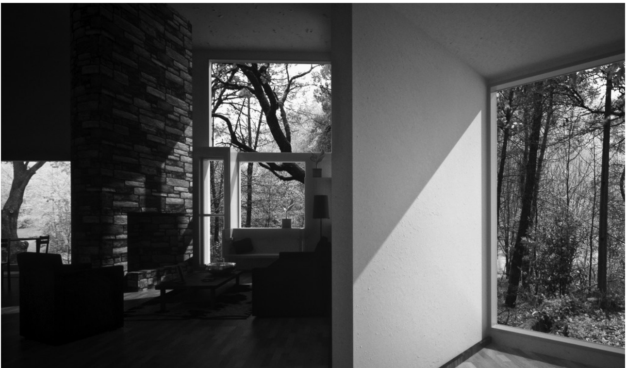
Figure 4. Louis I. Kahn , Fisher House, Philadelphia, 1967.

Defining education in this way couples it with the issue of beginnings, what Kahn called the search for volume zero or minus one . Each problem in the design studio was an opportunity for students and teachers to begin again, to reverse the roles of the clear and the obscure, not to make the second the preamble to the first but to discover what is unclear in what seems so obvious. Moving forward depends on going backward. The target of this kind of inquiry can be called the beginning of the beginning . While radically preliminary, this kind of start anticipates its end. For this reason he also called the beginning an "eternal confirmation" that reveals what is natural to man. "I try to look at my work," he said, "with a sense of what is forthcoming," the yet not said and yet not made, for that, he advised, is what "puts the sparks of life into you." 5 But again, the subject matter is "his work;" which is to say, the set of tasks he was given in those days, in that city . There can be no approach toward architecture apart from ex-