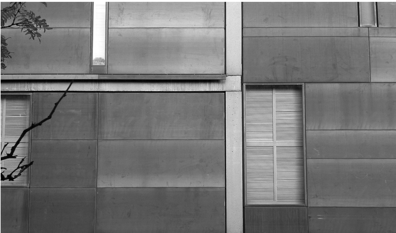
Figure 5. Louis I. Kahn , Yale Center for British Art, New Haven, 1974.

Professor of Architecture and Chair of the Graduate Group in Architecture at the University of Pennsylvania School of Design, Philadelphia, where he has taught since 1984. He received his B.Arch. from the University of Kentucky and holds a Ph.D. in Art from the University of Essex. He has also taught in England, at Cambridge University and the University of Westminster (formerly the Polytechnic of Central London). He is primarily known for his contributions to the field of architectural phenomenology. Questions of how architecture appears, how architecture is perceived, and how topography shapes architecture often direct his research.