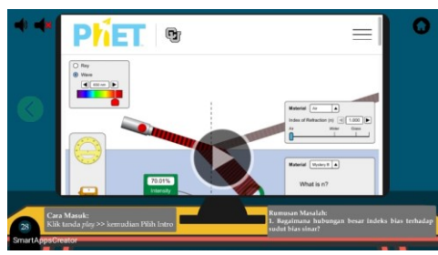
Figure 1 Somatic Aspect

This study used descriptive research and involved 27 students in grade 8 from a state Islamic Junior High School in Kediri. This SAVI-based interactive emodules is suitable for use based on validation results, it includes learning simulations, articles. materials. and formative assessments. The interactive emodules that use in the learning process has SAVI aspects as follows.