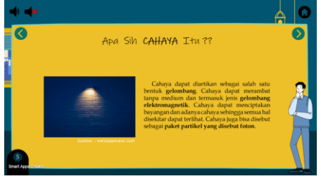
Figure 3 Visual Aspect