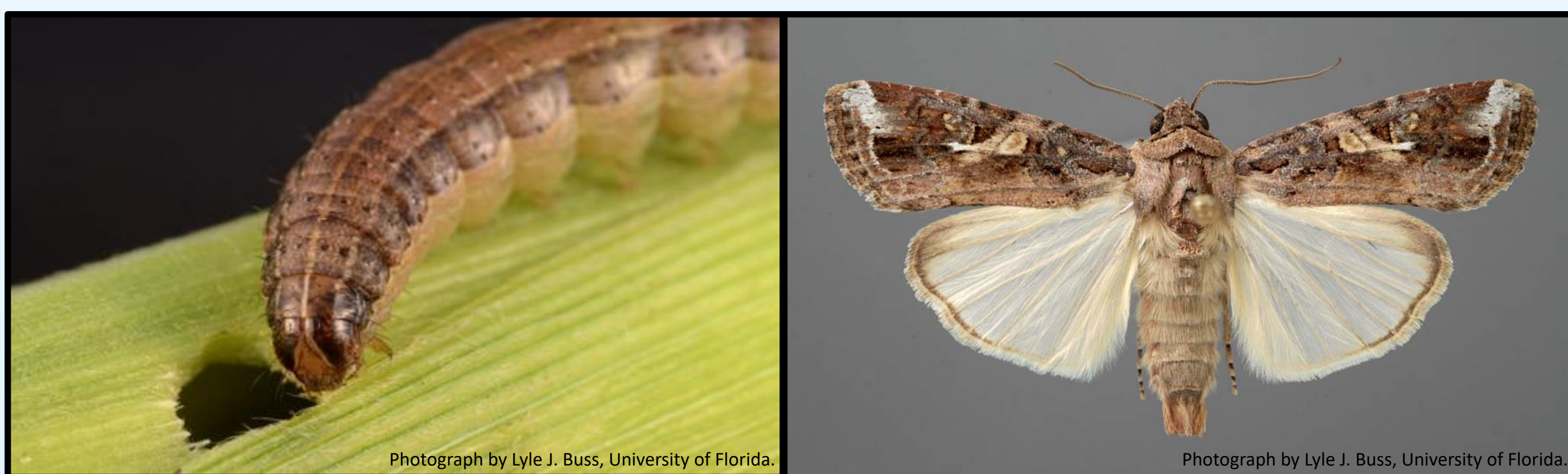
Fig 1. Fall armyworm, Spodoptera frugiperda (J.E. Smith) (Lepidoptera:Noctuidae) in its larval (left) and adult (right) life stages.

Fall armyworm (FAW), Spodoptera frugiperda (J.E. Smith) (Lepidoptera:Noctuidae) (Fig 1) is a cosmopolitan crop pest species that has evaded integrated pest management (IPM) strategies in many countries. Native to Central America, the pest is found in >40 African countries (Feldmann et al., 2019) and has spread across South and East Asia (Lamsal et al., 2020) and is now considered a global threat and is a quarantined pest in the EU.