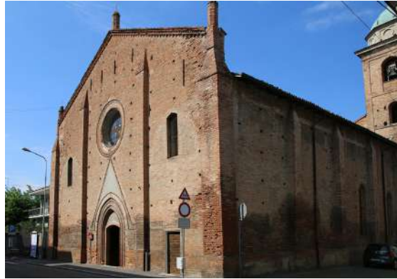
Fig. 1 The façade and the South-East flank of the church of Santa Maria Assunta in Pontecurone (2022).