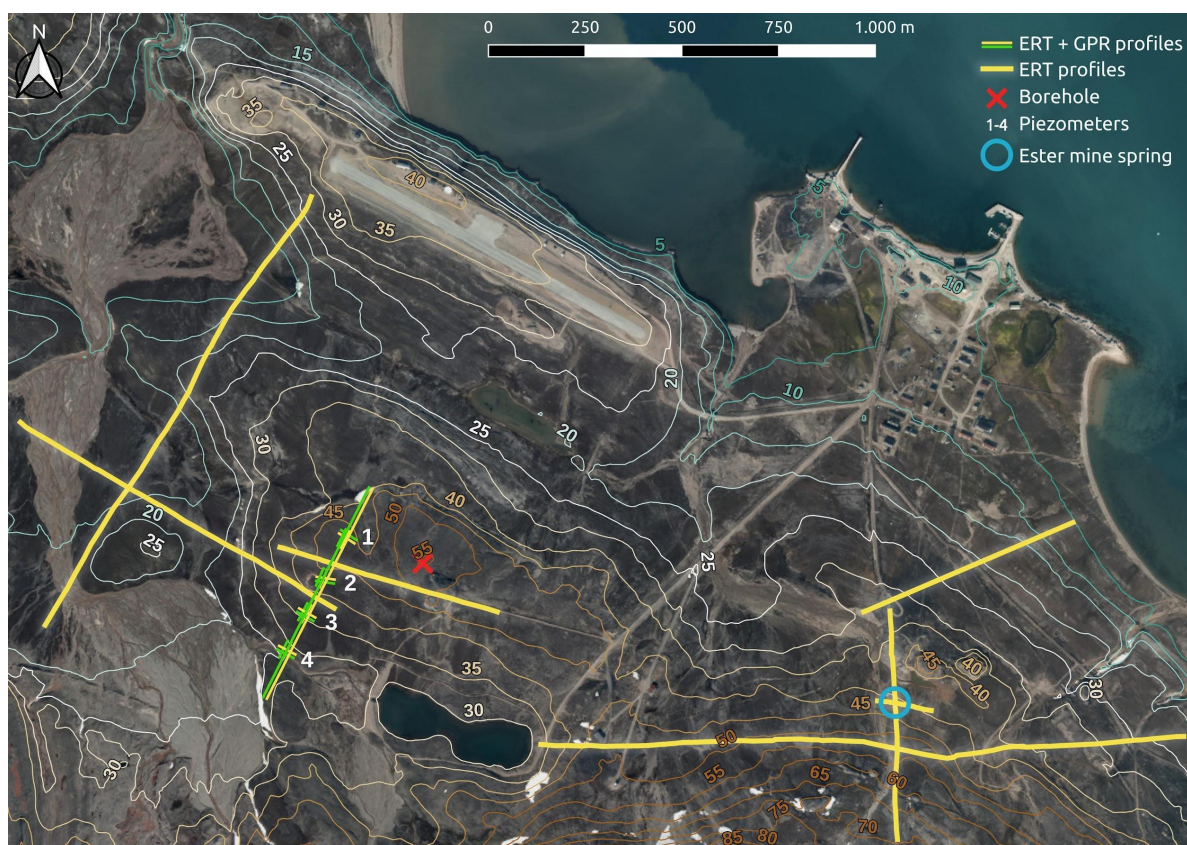
Fig. 1 – Map of the geophysical campaign carried out in Ny-Ålesund (Svalbard) in the summer of 2022. The ERT profiles are plotted in yellow and the GPR profiles in green. The investigated area on the west is the Bayelva river basin, while that on the east is the former mine. The piezometers are indicated with white numbers. The red cross is a recent borehole (48.5 m deep). The blue circle indicates the position of a spring (Haldorsen and Heim, 1999).

GPR measurements with 40 MHz and 400 MHz antennas were carried out in the area of the Climate Change Tower, close to the four piezometers aforementioned, for a total of around 2 km of GPR lines. Coincident ERT and GPR profiles with different acquisition settings were designed along the line of piezometers in order to correlate the geophysical results with the geochemical data and water table information coming from the piezometer monitoring (see Fig. 1).