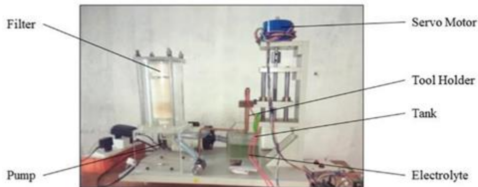
Figure 1. Experimental setup.