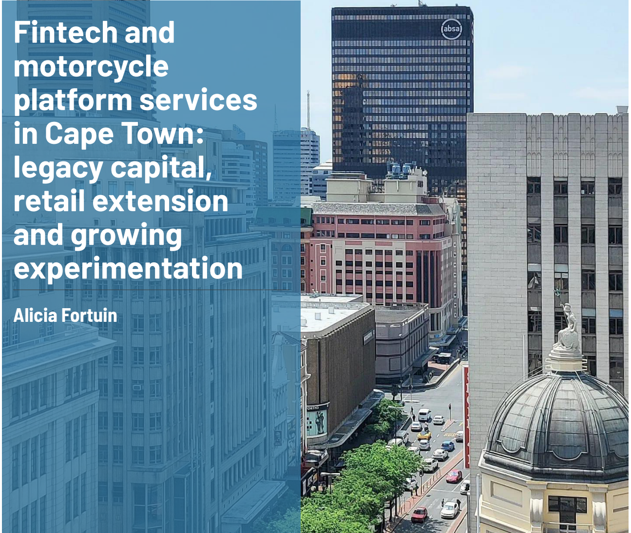
Adderley Street, Cape Town CBD