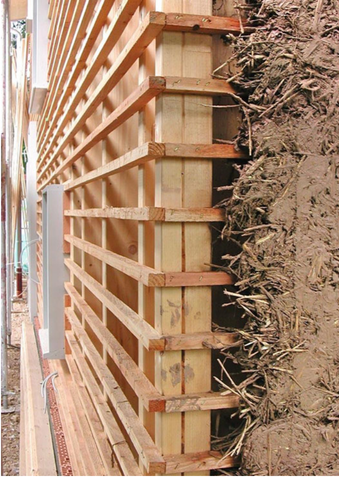
Fig. 33.6 Light-earth external skin applied onto battens in a new house in Darmstadt.

No data are provided for earth paints, which are usually ready-made products (4, 8).