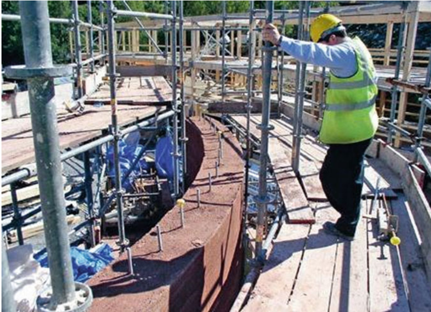
Fig. 33.7 Construction of the lecture theatre of the WISE at the Centre for Alternative Technology. The attractive load-bearing rammed-earth walls, 500 mm thick, are pneumatically tamped and left unfinished on both faces.

Emblematic is the case of stone: while being one of the most common materials in vernacular constructions, its use has drastically shifted from massive blocks that require minimal (if any) dressing to 1 ~ 3-cm-thick cladding slats. Both databases just provide values for thin elements that underwent cutting and finishing processes. In ÖBD, entries for 2 ~ 4-cm-thick granite and limestone elements assume processing—steel grit, grinding road, saw, and multi-blade saw. ICE V2.0 acknowledges that data sources were generally poor, except for stone slates. Quarried stone blocks are then associated with a risk of overestimating their embodied impacts if the custom values are employed. Even in cases when thin paving stone slabs were used, ecological considerations resulted in specifying little-processed elements: in 7, 50 ~ 70-mm-thick soapstone flooring slabs were obtained on site by cutting conglomerate rock boulders; in 21, 9-mm natural stone tiles were hand-cut with pliers and left unpolished.