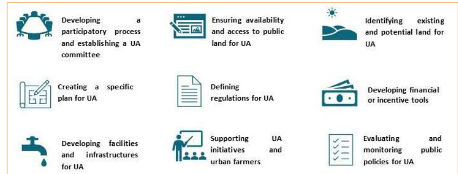
Table 2: Main policy recommendation to plan with and for urban and peri-urban agriculture. (Excerpt from Politecnico di Torino, 2023)

In conclusion, the toolbox for planning with and for UA includes inventories of available land, strategic and statutory plans, regulations, incentives (fiscal, or technical), and assessment tools. To support city authorities in the integration of UA into public policies, the EFUA Project proposes guidelines and recommendations (see Politecnico di Torino, 2022; Table 2). A clear identification of the desired benefits of UA should guide policy design (see article by Gottero, p. 9), guiding the choice of the UA Type and its possible location. Professional and non-professional farming deserve differentiated policies. A participatory approach, from the outset, can help – such as, for instance, creating a