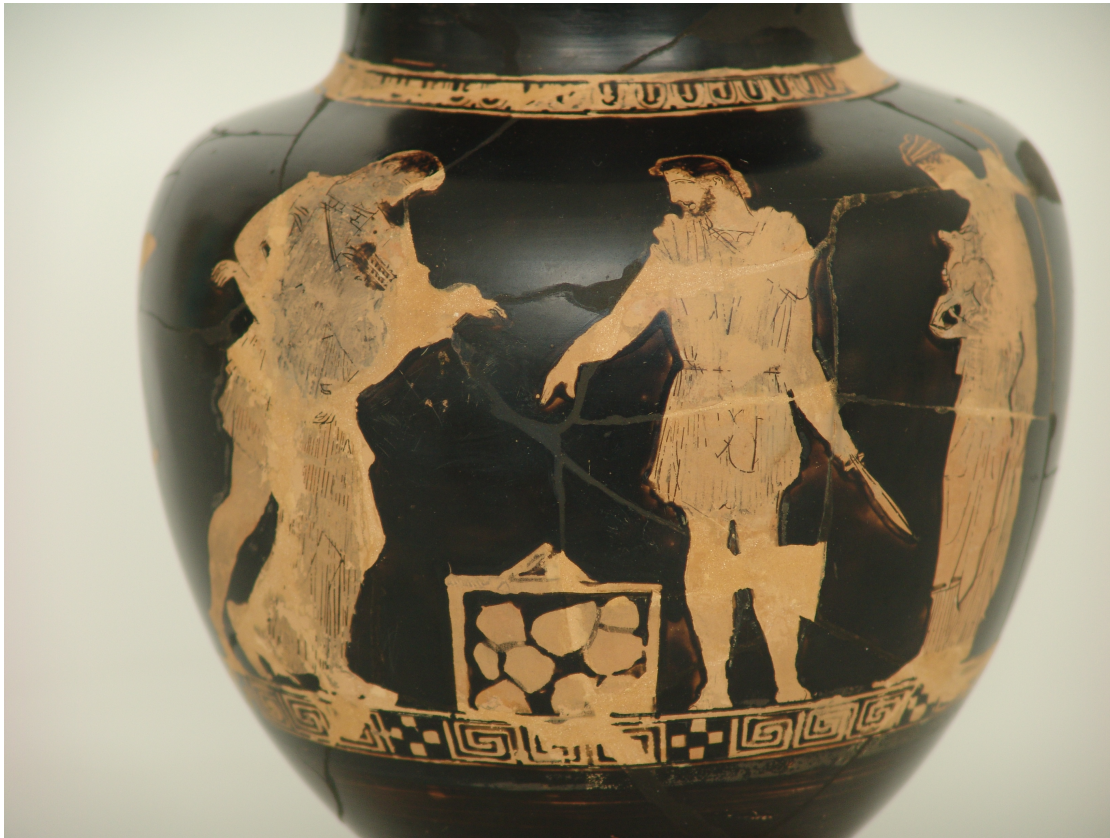
Figure 2. Attic red-figured oinochoe, Schuwalow painter, 430-420 a.C. Kiel inv. B 538.

This interpretation, which is corroborated by a comparison with the red-figured oinochoe of the Schuwalow painter, does not exclude the image of the young girl being enwrapped in her dress, but does exclude any explicit dissent on the part of the victim (at least at this moment of the ritual) which forces the soldiers to bind her.