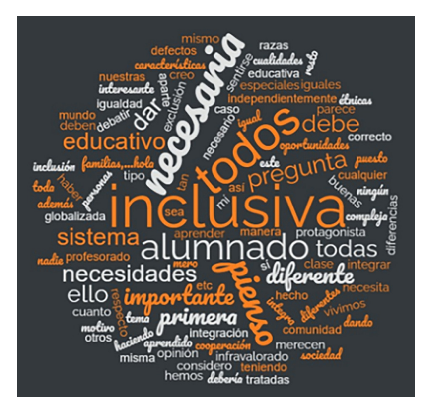
Fig. 4. Word cloud category inclusive education as a necessity (presented in the original language of the participants)

I believe that inclusive education is necessary in this complex and globalized society in which we live. I believe that the educational system needs inclusive education and not only the educational system but also the whole educational community that integrates it: teachers, students, families (MBER20–21).