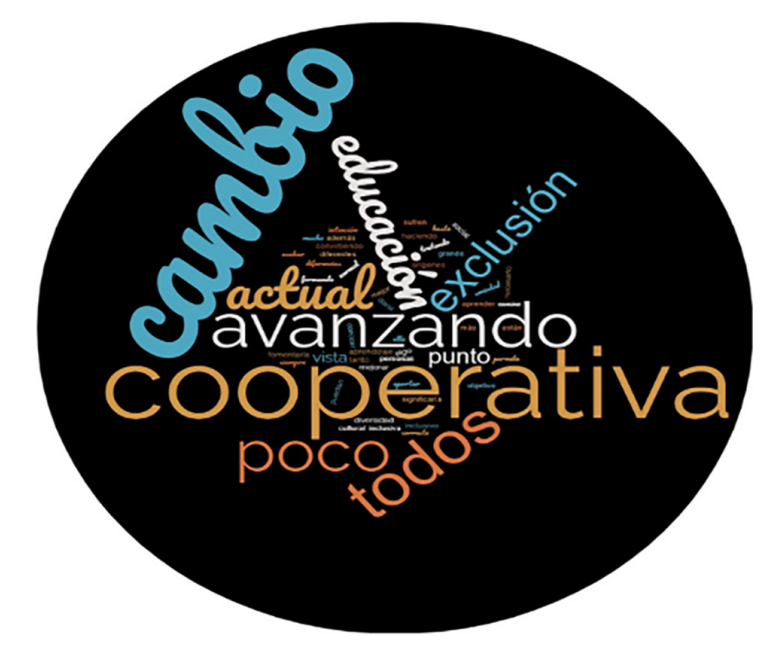
Fig. 5. Word cloud category slowly advancing (presented in the original language of the participants)

Students consider small changes at the school level and believe that university training can contribute to building a more inclusive school. However, they perceive that, throughout their initial training, they have yet to acquire competencies and strategies for this. But won't they have to teach and train us for this? Because I lack practical knowledge in terms of training (MQCO, 21–22), I have not received specific training to work in inclusion, and I have not experienced that reality yet. Until we actually do it, we cannot know if we will be able to do it (MBER, 19–20). Tomorrow, when we have to put it into practice, it will be different, and I believe we will need to continue our training (MBER, 20–21). In this sense, the term "training" repeatedly appears in most of the students' interventions in the forums (Figure 5). Additionally, concepts related to inclusion, such as change, teamwork, and coordination, are mentioned to a lesser extent.