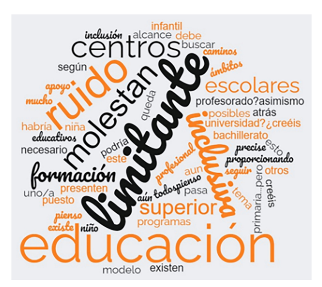
Fig. 2. Word cloud category constraints around inclusion (presented in the original language of the participants)

Likewise, as seen in Figure 2, the use of terms such as "limiting," "noise," or "bother" perpetuates and reinforces discourses that support rehabilitative and segregating practices. However, some students' responses to these forum entries suggest cooperative strategies, peer learning, or teacher training as possible solutions for peers who see limitations in inclusive education.