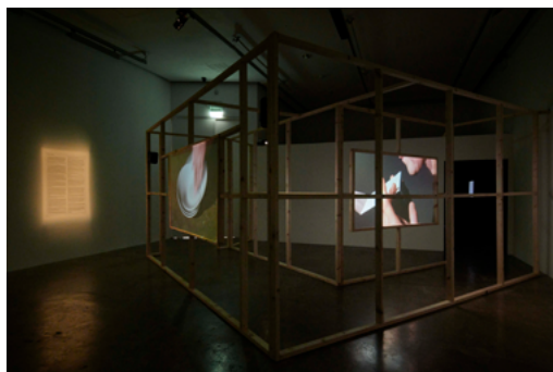
Right and below: Wait it Out , solo exhibition, Project Arts Centre, Dublin.