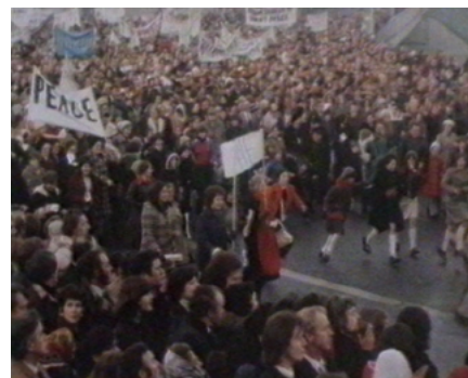
Right: Overprint , Alternating two-channel video.