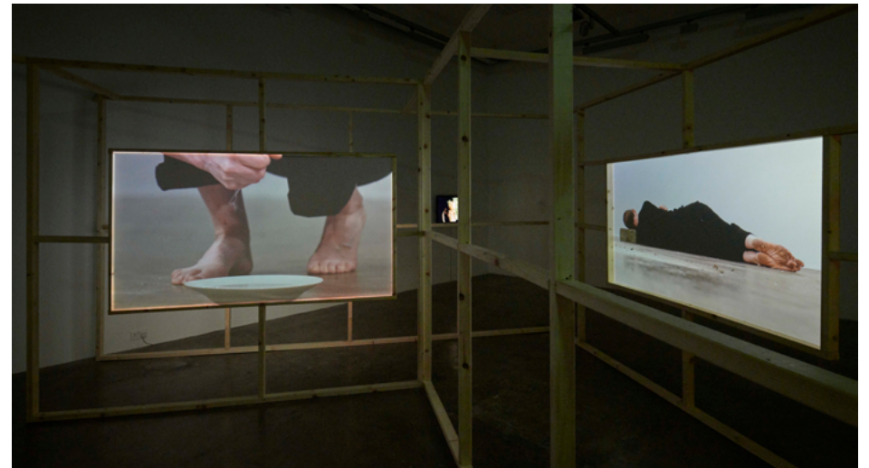
Right: Wait it Out , solo exhibition, Project Arts Centre, Dublin.