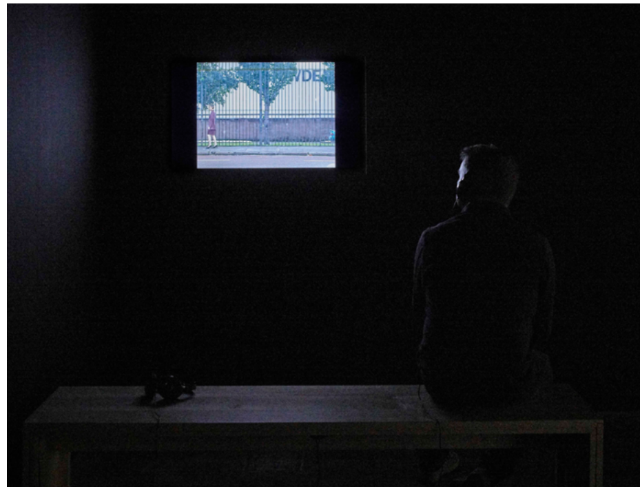
Above: Short Strand , (2000/2019) part of the constellation of videos forming Overprint .