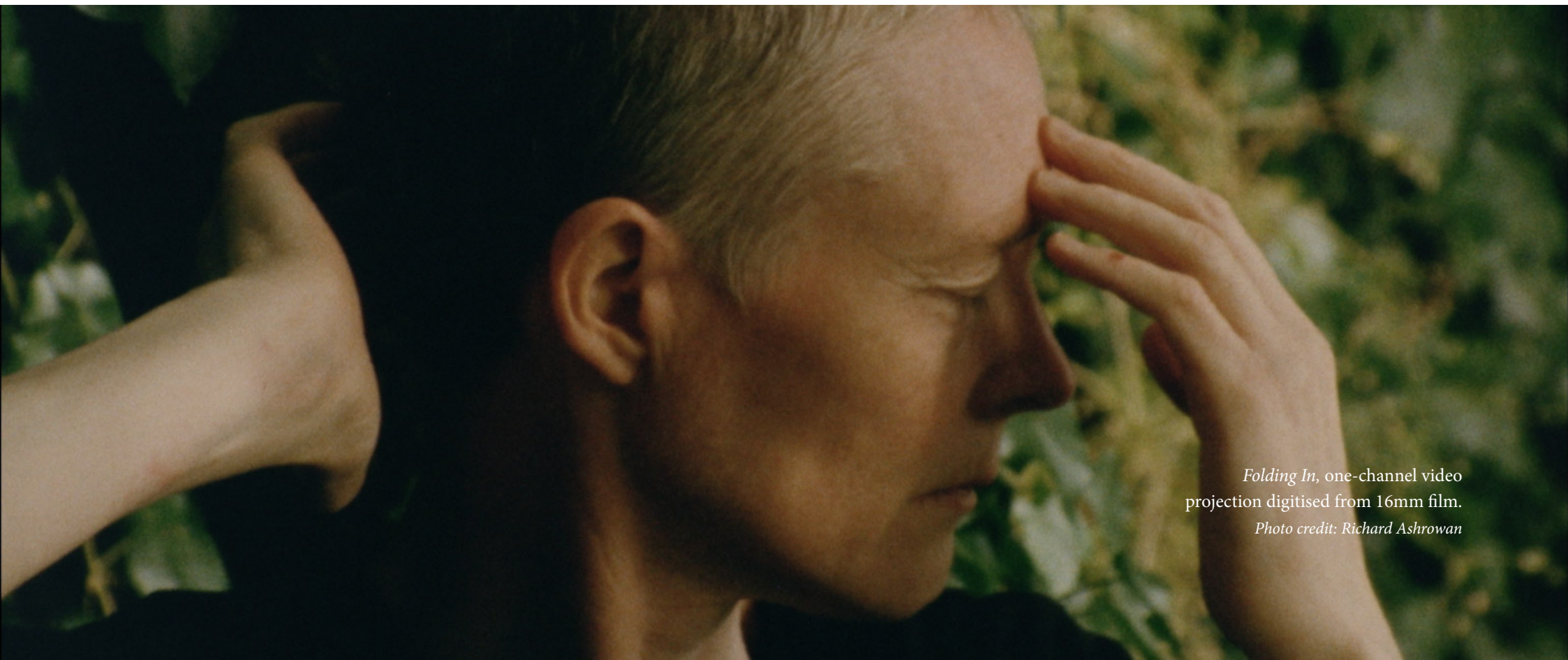
Folding In , one-channel video projection digitised from 16mm film.

The significant adjustment of the meaning of archival objects in Wait It Out resonates with Jane Blocker's research on artist's reshaping of charged objects, and the implications of performative responses to trauma and its residues. Creatively the work's process challenged Johnston to seek a liminal gap between performativity and filmmaking conventions that reflects on issues of conveying time. Lee's analysis (2006) of 1960s art experimentation with perceptions of time articulates comparable examples, especially Carolee Schneemann's Eye Body (1962-63) but Johnston's Wait It Out differs in mobilising strategies of temporal torsion upon a specific region and its troubled history.