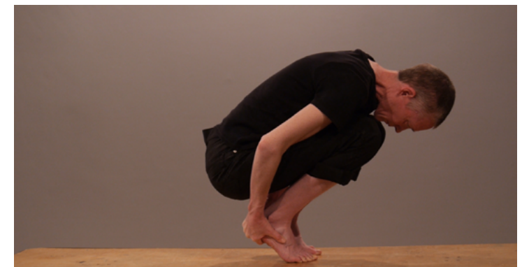
Right: That Apart, production screen shots.