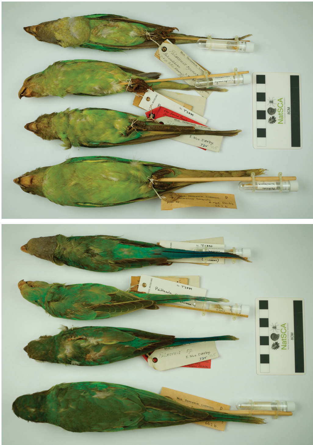
Figure 3. Ventral and dorsal views of juvenile specimens (from bottom) of Slaty-headed Parakeet Psittacula himalayana (NML-VZ D662b), Latham’s Rose-fronted Parrot (NML-VZ D765) and Plum-headed Parakeet Psittacula cyanocephala (NML-VZ T2889 and NML-VZ T2890bis) (John-James Wilson)