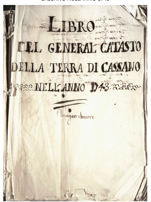
IMAGE 1. LIBRO DEL GENERAL CATASTO DELLA TERRA DI CASSANO NELL'ANNO 1743