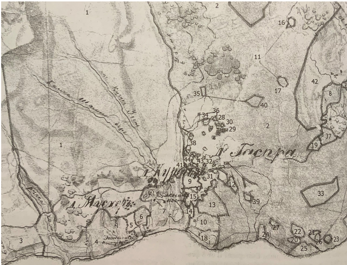
FIGURE 5 A FRAGMENT OF THE GENERAL SURVEY LAND PLAN OF THE YALTA DISTRICT

Dating to the 1830s, this plan shows the location of all land properties in the villages of Miskhor, Koreiz and Gaspra. In particular, the parcel numbers below refer to the lands occupied by the Tatar communities in Koreiz and Miskhor (1, 1656 dessiatins 347,5 square sazhen) and in Gaspra (2, 847 des. 895 sq. saz.); village Alupka (3, 1994 des. 190 sq. saz.) owned by Count M. S. Vorontsov and others as well as Vorontsov's other land parcels in Gaspra (20, 1 des. 1116 sq. saz. and 21, 2023 sq. saz.); land (4, 87 des. 2 192 sq. saz.) owned by Olga Naryshkina, the major's widow, in Miskhor; estate (6, 4 des. 1296 sq. saz.) of state councillor V. P. Zavadovskii; lands (7, 41 des. 590 sq. saz.) and (8, 11 des. 942 sq. saz.) owned by Princess A. S. Golitsyn; estates of Bunagi (13, 10 des. 323 sq. saz.) and Findi (18, 13 des. 2 115 sq. saz.) of colonel Prince S. I. Meshcherskii; Aianoga lands (28, 176 des.; 29, 70 des., and 30, 120 des.) owned by Mulla Ali, an official of the fourteenth rank of Tatar origin.