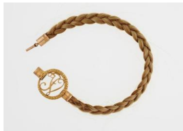
Figure 5. Hair Waving Bracelet (Note 2)