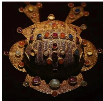
Figure 10. Golden Crown, Ming Dynasty, Saved in National Museum of China