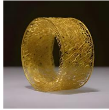
Figure 15. 18K Gold Bracelet, Giovanni Corvaja, Saves in Tacoma Art Museum