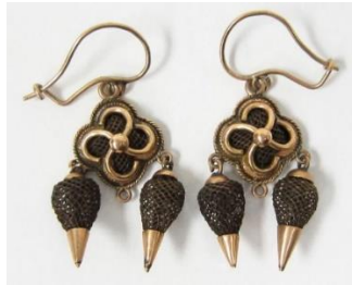
Figure 4. Hair Weaving Earrings from the Victorian Era (Note 1)

boiling it in soda water for 15 minutes, finishing it to length and dividing each piece into 20-30 small strands (Gu, 2016). In the mid-19th century, British jewelers used about 50 tons of hair per year to make mourning jewelry, which shows how popular mourning jewelry was at that time, and its commemorative significance is far greater than the decorative significance. Hair woven jewelry is rare in the time after that. In the modern time, some people like to use the hair from their relatives or fur from their pets to make weaving jewelries (Figure 6).