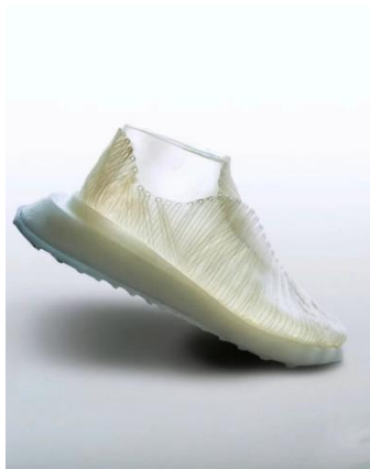
Figure 21. Biomaterial Weaving, Mordern Synthesis Company, England

Many weaving jewelry products are not made of in only one material. Some designers use various materials and new techniques to show the jewelry of innovativeness.