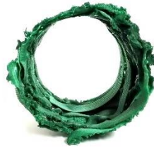
Figure 18. Nylon Bracelet, Clizia, Italy