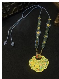
Figure 16. Pendent, China

The use of rope in knot shape jewelry design is more common, combined with different rope color, make a different meaning of the beautiful knot. Weaving materials are slender and soft, and the most used materials in traditional weaving are yarn and floss, which are easy to weave, easy to cover, close to life, and give people a calm and warm psychological feeling. Many jewelries in China are used yarn or floss to weave which contain the auspiciousness moral, some of them are made by pure yarn weaving, however, most of them are used to decorate gold or silver pieces with general line that have Chinese traditional auspicious ornamentation. Japanese ropemaker Satsukazu Matsuda uses cotton yarns to weave jewelry with lace patterns. Italian artist Clizia weaves bracelets with nylon fibers in romantic colors to create resonant themes by montage technique.