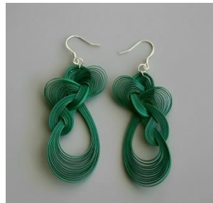
Figure 1. Earrings (By Diao Xiaokuan, China)

the texture of bamboo mainly includes the natural rhythm of bamboo node texture, smooth and refreshing skin texture, vertical and delicate longitudinal section texture, beautiful and smooth, rough and simple transverse section texture, as well as rich and soft woven texture. The bamboo is common and easy to get in many countries and areas, bamboo is also can be bend easily to make different angles and shapes. There are many outstanding artists are famous by making bamboo jewelry such as Diao Xiaokuan from China, Silvia Furmanovich from Brazil, (Figure 1, Figure 2) etc. The clean and moist color makes the whole bamboo hair pin bright and clear, and highlights the rich changes in the structure of bamboo, so that bamboo jewelry is favored by many luxury brands, such as Boucheron who has a necklace combining bamboo with diamond which is luxurious and unique (Figure 3).