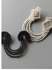
Figure 17. Cotton Earring, Satsukazu Matsuda, Japan