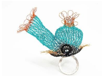
Figure 12. Ring, Leslye Zhang