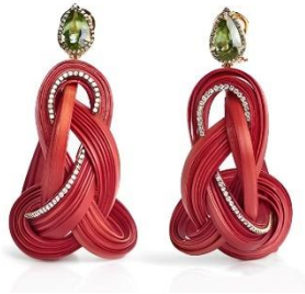
Figure 2. Earing (By Silvia Fuimanovich, Brazil)