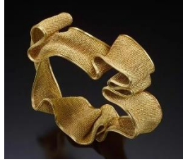
Figure 14. Gold Necklace, Mary Lee Hu