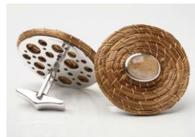
Figure 9. Ciranda Cufflinks, Ivete Cattani, Brazil