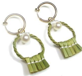
Figure 8. Rice-Straw Earrings, Momoko Fujii, Japan