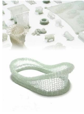
Figure 20. Light silica Weaving, Sarah Roseman, Canada