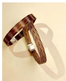
Figure 6. Horsehair Bracelet, CJ Horse-Element Studio (China)