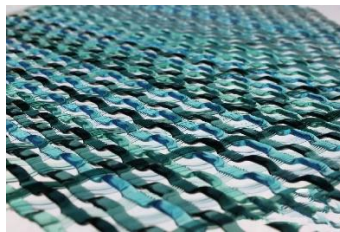
Figure 19. Glass Weaving, Elisa Strozyk, German

The contemporary jewelry landscape has witnessed the integration of unconventional materials into weaving art. Innovations such as incorporating recycled materials, unconventional metals, or even 3D-printed components push the boundaries of traditional jewelry design. This fusion of weaving techniques with modern materials open up new possibilities for creativity and sustainability in the industry. German designer Elisa Strozyk makes a nice glass weaving works, firstly she puts colored glass stripes in a kiln, and then weaves these glass stripes in different layers, the different colors of glass is overlapped and intertwined, the works are magnificent under the light (Figure 19). Sarah Roseman, a Canadian designer, has developed a new material between textile and glass to weave a fabric that appears to be suspended in mid-air (Figure 20). Mordern Synthesis Company uses microbes to create a firm, lightweight bio-woven material that reduces pollution (Figure 21). There are also many materials used for weaving, such as acrylic, resin, etc., as a Chinese proverb says: everything can be woven. With the development of technologies such as 3D printing, more and more high-quality materials will emerge for weaving.