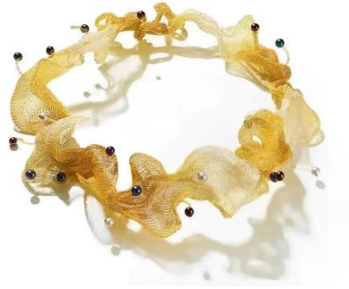
Figure 11. Golden Crown, Zhang Fan