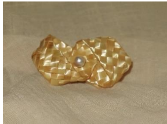
Figure 7. Wheat-Straw Brooch, Xinhe Caobian, China Qingdao

willow, wood, these ingenious straw products have not faded the fragrance of the field, and put on the luster of fashion (Figure 7). Japanese designer Momoko Fujii uses Rice leaves and straw to make jewelry, the jewelries may turn yellow from bright green after the completion as time goes by, the changes of the color make a bridge between the wearer and the designer (Figure 8). Many Brazil jewelry designers like the use natural fiber to make jewelry, such as Ivete Cattani made a pair of cufflinks (Figure 9) by using one special fiber called golden grass ( Syngonanthus nitens Bong. Ruhland), which is distinguished from the others by the golden glow specific of the species and only found in a small area of the Cerrado biome.