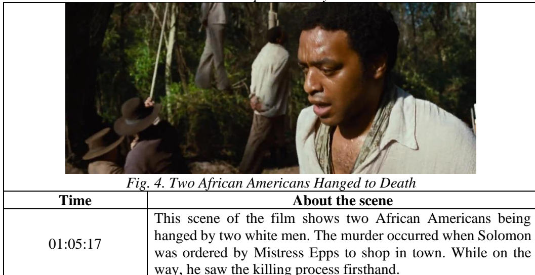
Table 4. Extermination Represented by Black Slaves in the Forest

Solomon did not know the exact reason why the murder occurred because he only caught a glance at the incident. He did not dare to say or do anything so that he was safe and could continue to walk to his destination. But clearly, this scene falls into the category of extermination action because the character through the external action at that time was hanging two African Americans until their lives were lost.