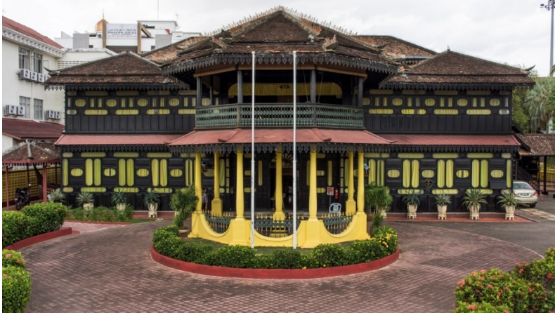
Fig. 1. Adaptation of Istana Jahar through various functions before its transformation into a museum.