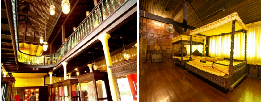
Fig. 5., and 6. Incorporating historical-style fittings to preserve aesthetic coherence in the museum.