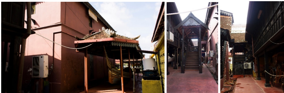
Fig. 2., 3 and 4. The improperly placed outdoor air-conditioning units compromised the aesthetic and historical integrity of Istana Jahar.

For Istana Jahar, preserving its original aesthetics is essential while providing a controlled climate for exhibits and visitor comfort. Concealing ductwork and vents and carefully selecting air conditioning units that blend with the interior design will aid in achieving this balance. By adhering to these recommendations, Istana Jahar can benefit from modern climate control while safeguarding its architectural heritage.