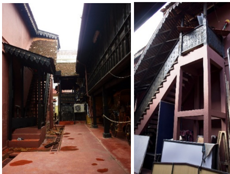
Fig. 7., and 8. Emergency staircases provide direct access from the first floor of Istana Jahar to the outdoor area.

Compliance with fire safety regulations is imperative for Istana Jahar to function as a public space. This necessitates installing fire detection systems, emergency lighting, emergency exits, and fire extinguishers. While implementing these fire safety measures, it is essential to discreetly integrate them and design them to minimise their visual impact, thereby preserving the building's significant heritage value. Collaboration with fire safety experts is recommended to develop a comprehensive fire safety plan that meets contemporary requirements while preserving Istana Jahar's historical fabric.