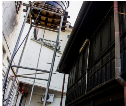
Fig. 9. Inappropriate water tank tower impairs the aesthetic appeal of the building.