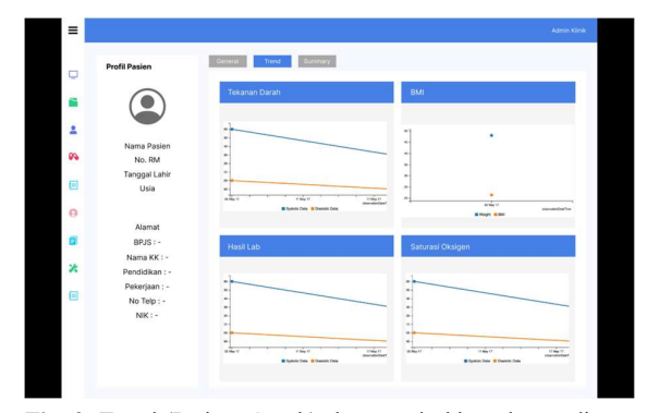
Fig. 2. Trend (Patient Graph) shows a dashboard regarding patient trends containing blood pressure, BMI, lab results and oxygen saturation