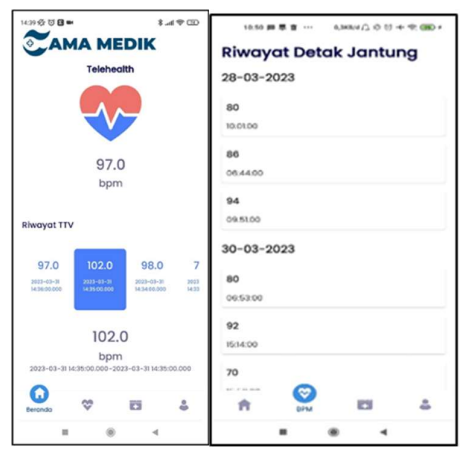
Fig. 6. Application of Gama Medik for a Wearable device

The following (Figure 6) is a prototype of a medical gamma application (Monitoring application) that utilizes wearable devices and is integrated with electronic medical records in primary care.