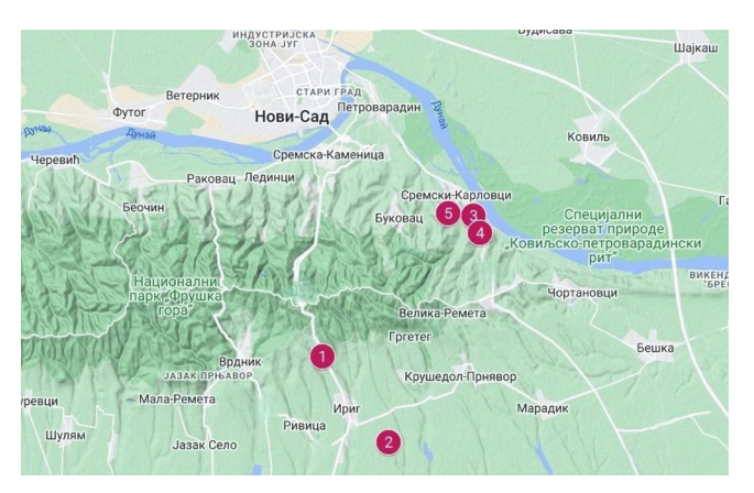
Fig. 1. Location of the study region and wineries around Fuska mountain (at rural settlements: 1 - Tursko Brdo; 2 - Plavulja; 3 - Čušilovo; 4 - Lipovac; 5 - Cerat).

The research was conducted in the vineyards of private wineries located in the southeastern and northeastern part of the Fruska Gora mountain range on the Middle Danube Foothills (Right Bank of the Danube) in the Autonomous Province of Vojvodina, Republic of Serbia (Figure 1). The climate of the study area is temperate continental with elements of subhumid and mesothermal in some locations. The average annual air temperature in the study area is 11.8°C, the average annual precipitation is 764 mm.