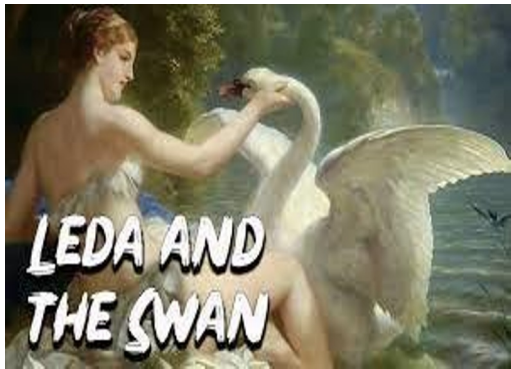
Figure 3. Leda and the Swan