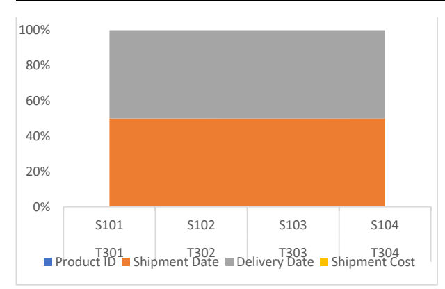
Fig. 4. Specifics of Transportation

AI-supported transportation optimization results in considerable cost savings and increased delivery efficiency. This impact is shown by the transportation data analysis, which shows a significant cost reduction in shipments optimized by AI. For example, Transport ID T301, which used AI-driven route optimization, cost $500.00, which is 10% less than shipments that were not optimized. These cost benefits are a result of AI's capacity to optimize load scheduling, design routes, and save fuel use. Additionally, continuous on-time performance is shown by the AI-optimized deliveries, improving overall supply chain dependability and customer satisfaction.