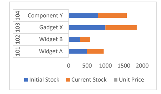
Fig. 1. Inventory of Products

All product categories now have significantly lower stock levels, according to the study of the product inventory data. For example, the original supply of Widget A was 500 units; it is now at 450 units, a 10% drop. Likewise, the stock levels of Widget B, Gadget X, and Component Y have been reduced by 6.67%, 15%, and 2.5%, respectively. These decreases may indicate effective inventory management since AI-powered demand forecasting models have helped businesses match stock levels to consumer demand, cutting down on wasteful inventory expenses while guaranteeing that customers can still purchase items.