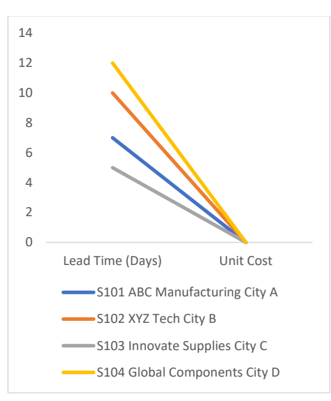
Fig. 2. Details about the Supplier

The study of supplier information reveals different performance levels among our imaginary vendors. For example, ABC Manufacturing from City A provides the most affordable unit cost of $8.00, with a lead time of 7 days. Comparing this to the most expensive supplier, XYZ Tech, whose unit cost is $12.00, is an enticing 20% cost savings. With a lead time of only 5 days, Innovate Supplies from City C may be able to fulfill orders more quickly. AI-assisted supplier selection models may help find and collaborate with suppliers that provide competitive pricing, timely delivery, and high-quality items, thereby improving the supply chain.