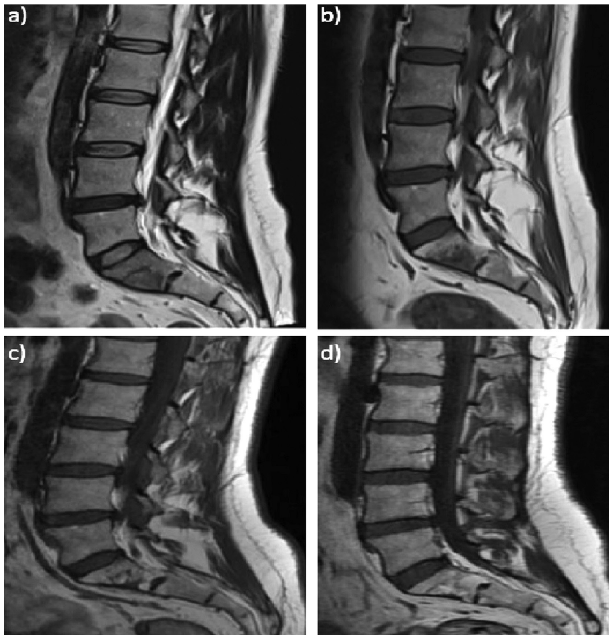
Figure 2. Radiological imaging of a 47-year-old male patient with S1 vertebral bone involvement a) MRI was taken after the patient had low back pain, hypointense signal was present in the S1 vertebra in the sagittal T1 sequence. b, c, d) Sagittal T1 sequence of the patient's control MRI was taken six months, one year, and two years later.