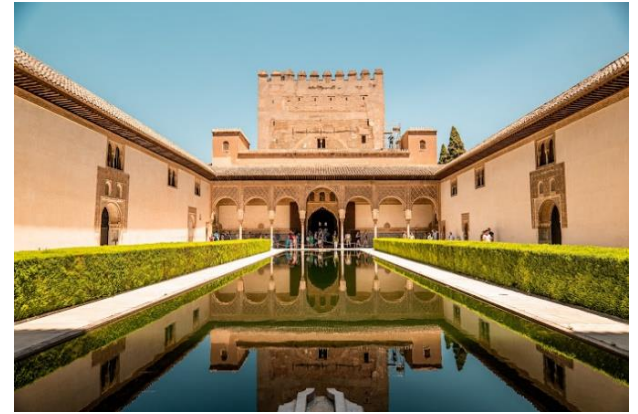
Figure 3. The Alhambra Palace in Granada, Spain