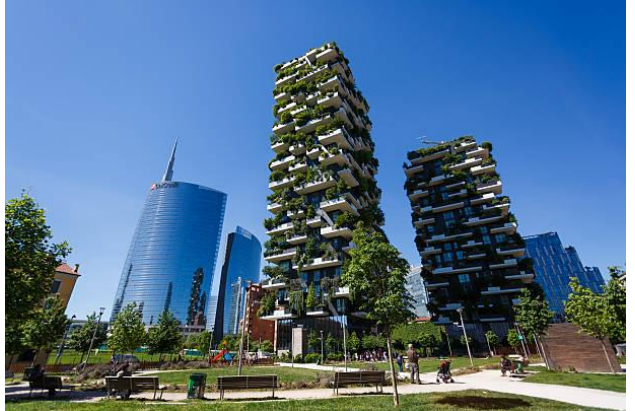
Figure 1. Bosco Verticale - Milan's Vertical Garden in Italy.

The Kiyomizu Buddhist Temple in Kyoto, Japan (Figure 4), with its origins dating back to 778, towards the end of the Nara period (Louis, 1996). It was erected in the 9th century, nestled amidst a dense forest of cherry and deciduous trees, making it an iconic example of nature integration in Japanese architecture.