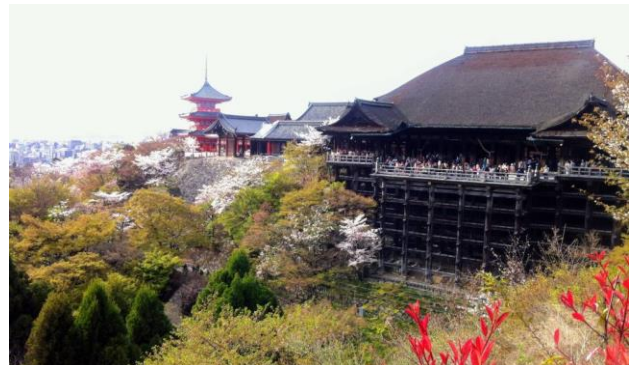
Figure 4. Kiyomizu Buddhist Temple in Kyoto, Japan

It is interesting to note that these exceptional architectural works, although not initially designed with a concern for biophilia, are now considered excellent examples of successful biophilic design (Moltrop, 2011). Research on the integration of biophilia into architectural design education, while valuable, has been limited by small sample sizes, diverse methodologies, and disparate creativity assessment criteria. Future research should strive to use larger samples, consistent methodologies, consistent creativity measurement criteria, long-term studies in professional contexts, interdisciplinary approaches, and examine the role of instructors in promoting biophilia integration in architecture and enhancing the creativity of future architects.