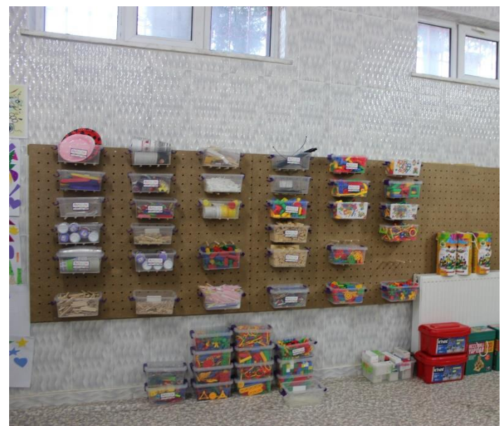
Figure 2. STEAM Makerspace-Engineering Space

In a bid to optimize space and ensure children's ease of movement, the walls of the Makerspace are utilized effectively, adorned with transparent boxes containing diverse materials. These boxes hold an array of items, from everyday materials that children can interact with, to technologically advanced materials and those specific to STEAM disciplines (Mercan, 2019) (refer to Figure 2).