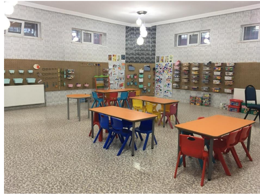
Figure 1. STEAM makerspace

STEAM Makerspace was prepared in a kindergarten affiliated to the Ministry of National Education in Gaziantep, Turkey within the scope of Mercan's (2019) doctoral dissertation titled "The Effect of Early STEAM Future Readiness Program on Children's Visual Spatial Reasoning Skills" to support children's STEAM learning (See Figure 1).