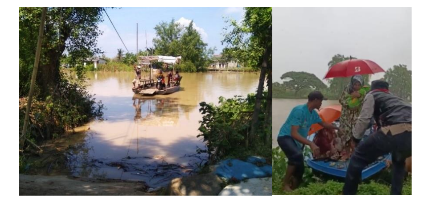
Figure 2. Bamboo Raft (Left), on their way to hospital (right) (Author, 2022)

An interview with Raka (pseudonym, 39) presents today's Pantai Bahagia's economic condition. For many second-generation settlers, catching shrimp and crabs using traditional tool, called bubu, provide a way to survive the worsening condition. "We usually catch 3 kilos of shrimp at most; that is when the season is good. The middlemen set a price at Rp. 20.000/kilo (USD 1.35) for small shrimp and Rp. 50.000/kilo (USD 3.37) for tiger prawns". While for fishermen from Cirebon and Indramayu who go to the open sea, a specific work system applies; they highly depend on pengepul ikan (fish collectors or middlemen) to provide solar or other fishing tools. This system of fixed subordination between middlemen and fishermen has become the main representation of the Pantai Bahagia economic system. The low-income feature, in addition to damaged road access, minimum public facility, and constant flood, categorised Pantai Bahagia as underdeveloped village. It took 45 minutes by motorcycle to reach Pantai Bahagia from Muaragembong Central District. The distance is around 10 kilometres, crossing over dirt and damaged roads. In 2022, the road access to the village is repaired, even though in a short time, constant tidal flooding makes the road susceptible to damage (interview with Abang, pseudonym, 41). Another means of transportation is using a boat or eretan (bamboo raft); this access, however, highly depends on the river conditions.