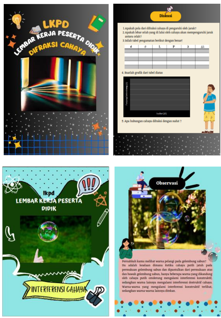
Figure 3. Student Worksheets Appearance