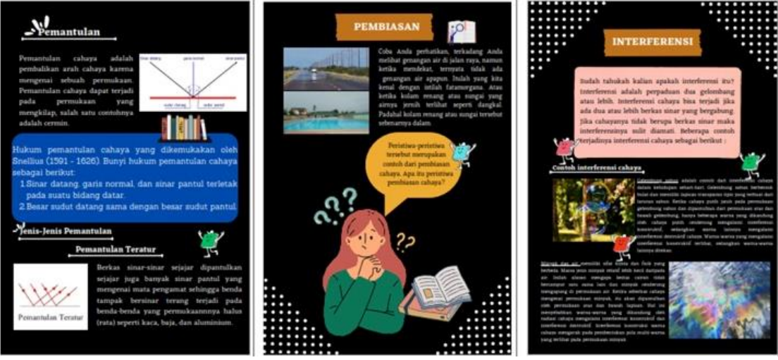
Figure 2. Modul Appearance as Part of the Product