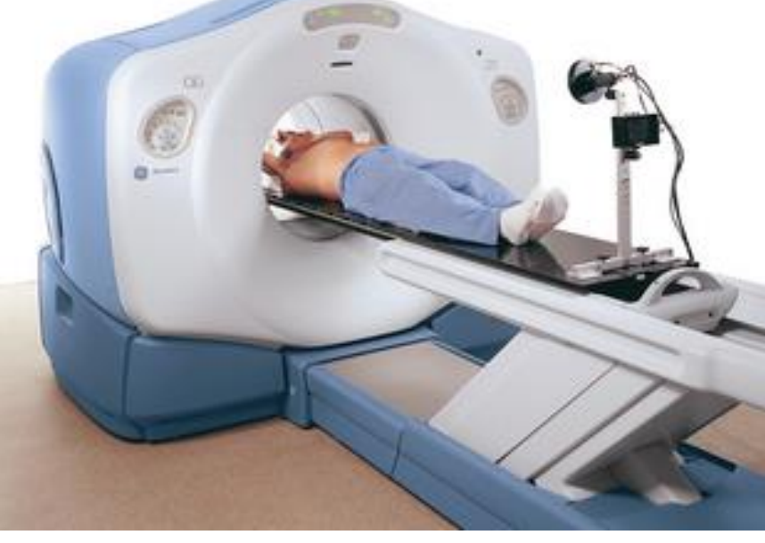
Image 1: Displays gaiting simulation set up (GE Medical Systems, n.d.)[Picture].

• Gating resulted in a 67% reduction of overall radiation dose to the patient when deep inspiration breath hold was used (Ciervide et al., 2021, p. 2358).